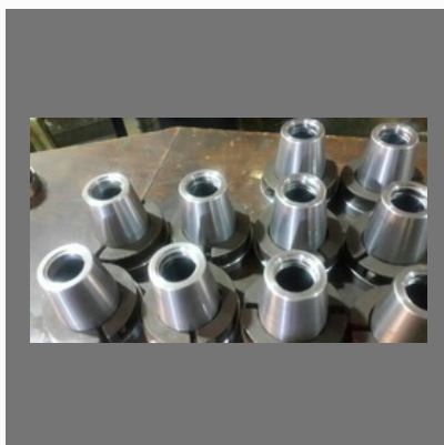
Bottle Top Mould