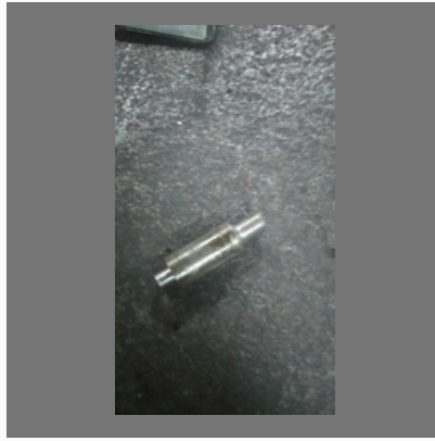
Metal Door Pin