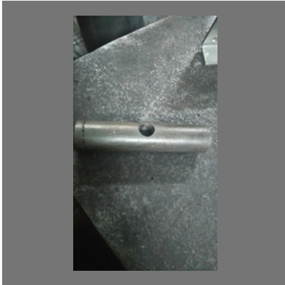
Drilling Job Work