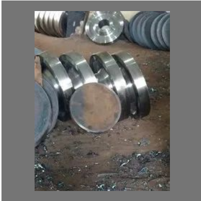
3 Feet Flywheels