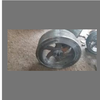
6 Groove Motor Pulleys