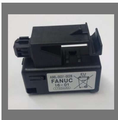
Fanuc Battery A98L-0031- 0028