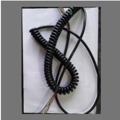
Mpg Spiral Cable