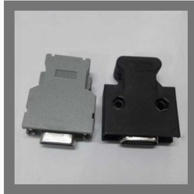
20 Pin PCR Connector A02B-0120-K301