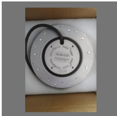
Motor Cooling Fan A90I-0001-0515/r