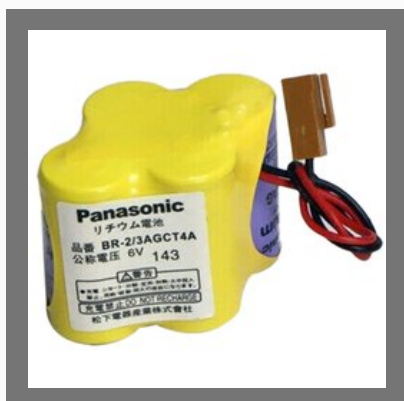
Panasonic Battery Br-2/3agct4a