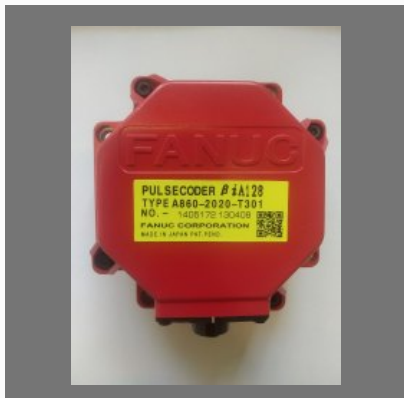
Pulsecoder B i A128 TYPE A860-2020-T301