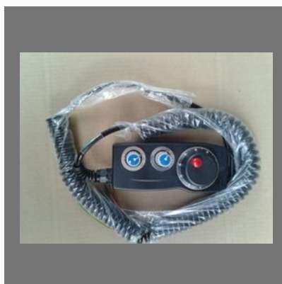
Mpg Hand Wheel