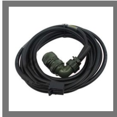
Power Cable For Fanuc CNC Machine