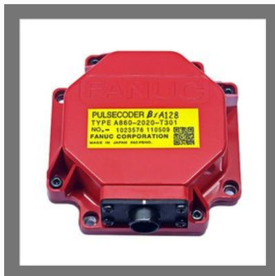
Funuc Encoder For CNC Machine