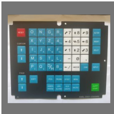
Fanuc Membrane Keypad A98L-0001-0568-M Fanuc