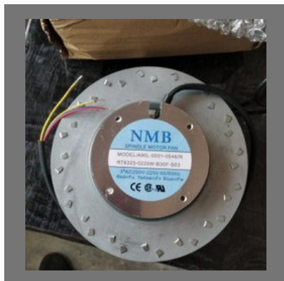
Spindle Motor Fan A90L-0001-0548/R