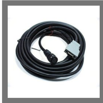
Fanuc Encoder Cable