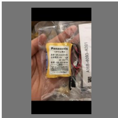
Panasonic Battery BR-AGCF2W A98L-0031-0011L