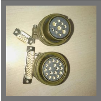
Connector For Delta B2 Servo Motors