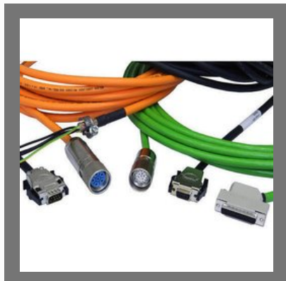
Power And Encoder Cable for Servo Motor