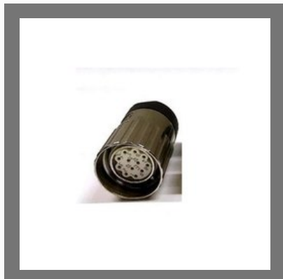
Connector for CNC Machine