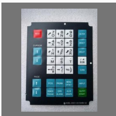
Fanuc Membrane Keypad A98L-0001-0518 M 02 Fanuc