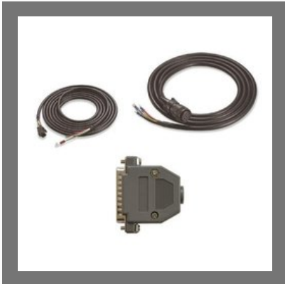
Servo Cables And Connector Set