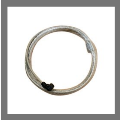
Encoder Cable A660-2005-T505