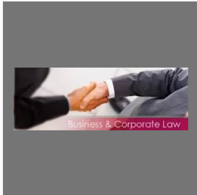
Business And Corporate Laws