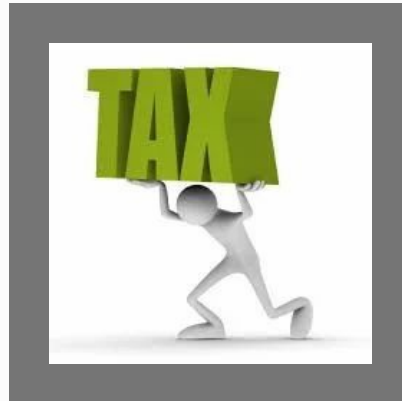
Taxation / Legal