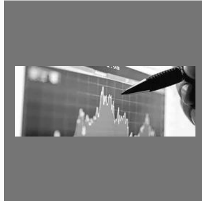
Accounting And Compliance Services