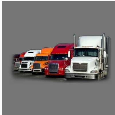
Goods Carrier Vehicle Insurance