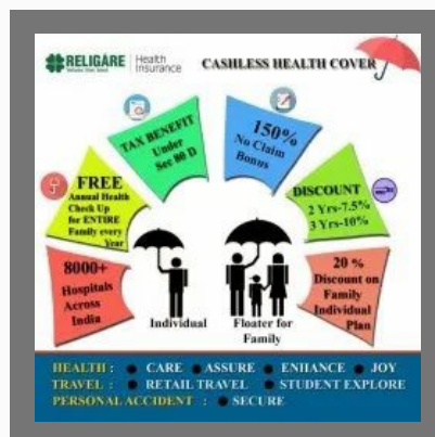
Religare Health Insurance