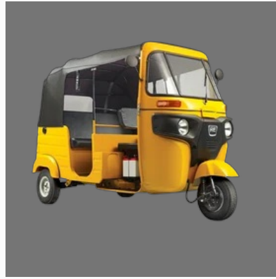
Auto Rickshaw Insurance Third Party Or Full