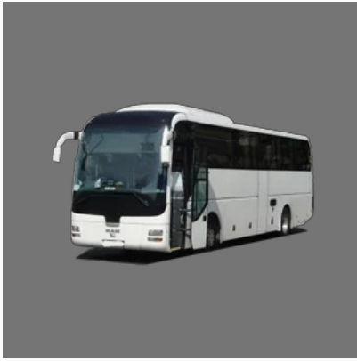
School Bus Insurance Third Party Or Full