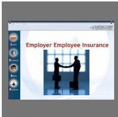
Employee Group Health & Group Life Insurance