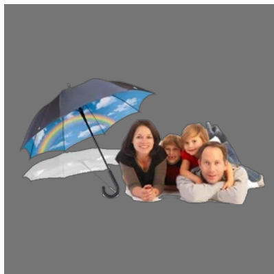
LIC Life Insurance