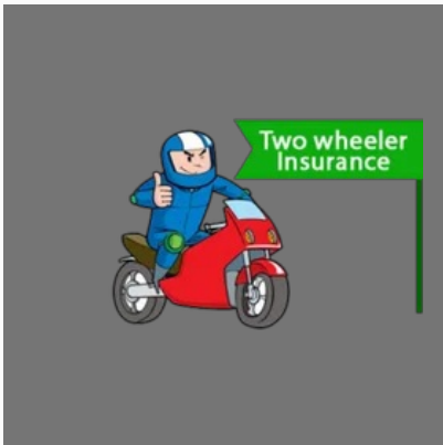
Two Wheeler Bike Insurance Third Party Or Full