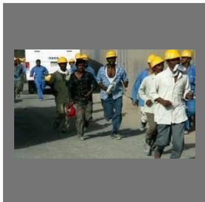
workman compensation policy