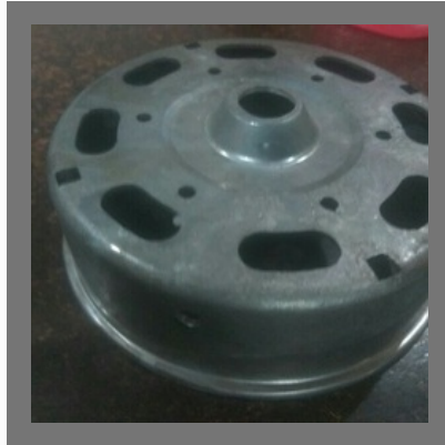
Aluminium Fan Parts