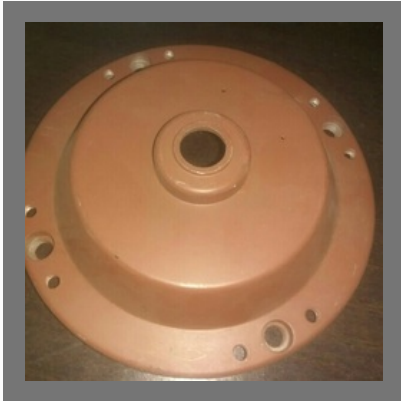
Table Fan Parts