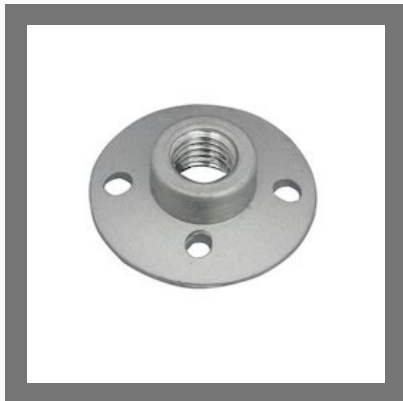
Zinc Die Casting