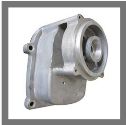
Aluminum Pressure Die Casting