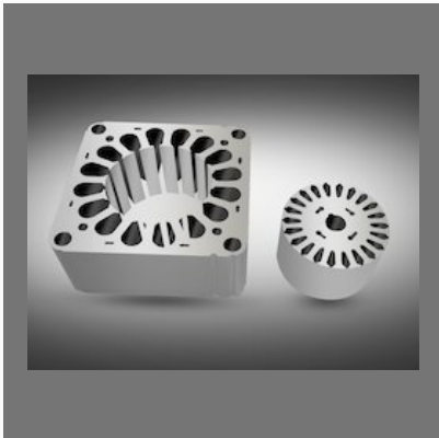
Table Fan Rotor