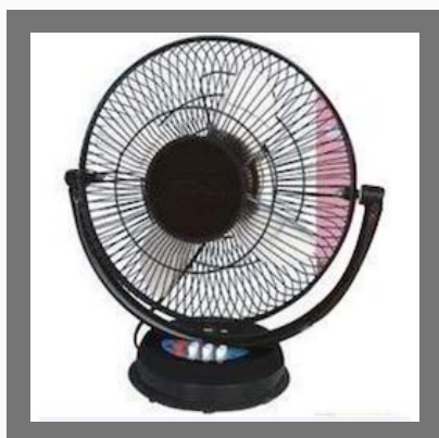
Table Fan Body