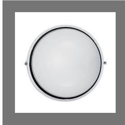
Aluminum Ceiling Fan Covers