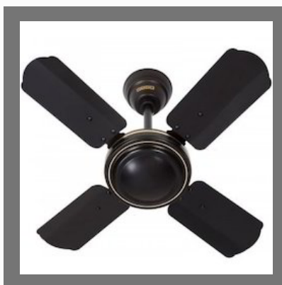
Ceiling Fan Body