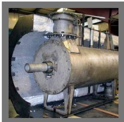
CNC Machining Job Work