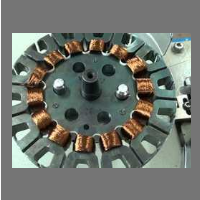
Table Fan Stator