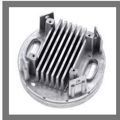
Aluminum Alloy Die Casting