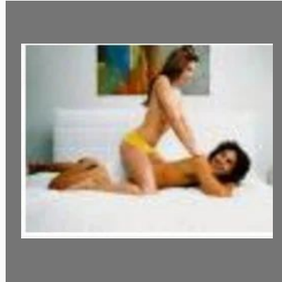
Full Body Body Massage