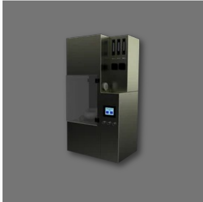
Disposable Bioreactor Systems