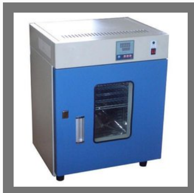
Labon Bacteriological Incubator Bottom Heated