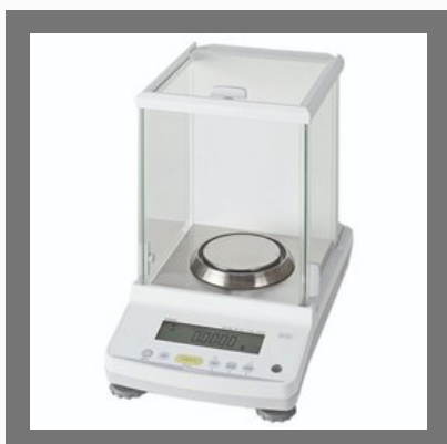
220g/0.1mg Shimaduz Analytical Balance