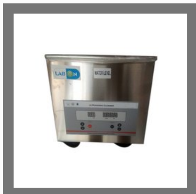
Ultrasonic Cleaner / Ultrasonic Bath