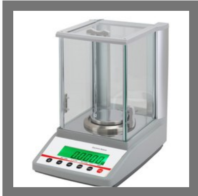
0.1mg Labon Analytical Balance