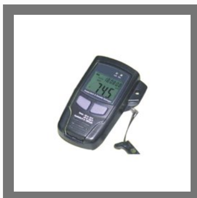
Temp Humidity Data Logger