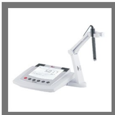
Conductivity / TDS Meter