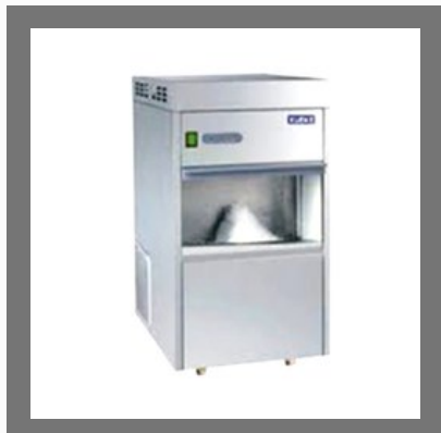
Ice Cube Making Machine