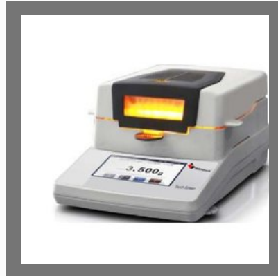
Labon Moisture Analyzer