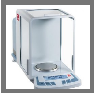
0.01mg Labon Semi Micro Balance