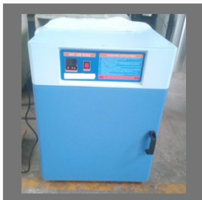
Laboratory Hot Air Oven