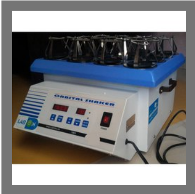
Labon Orbital Shaker