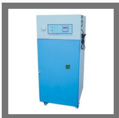
Labon BOD Incubator Cooling Incubator