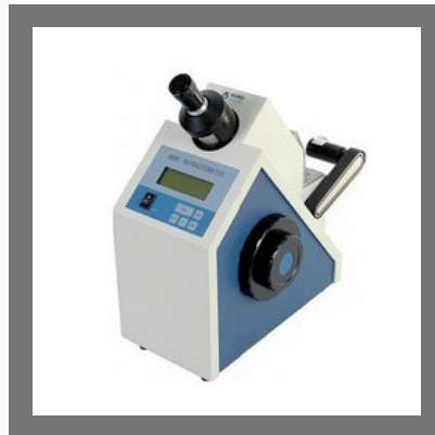
Labon Digital Abbe Refractometer