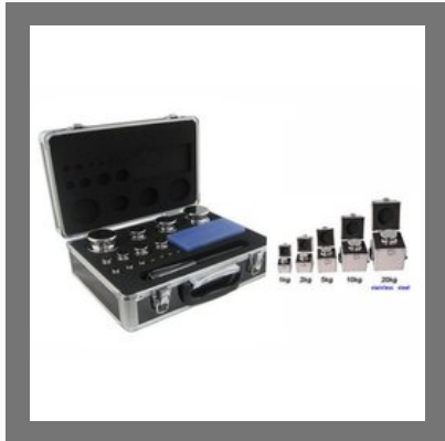
Labon Standard Weights