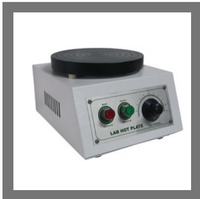
Laboratory Round Hot Plate