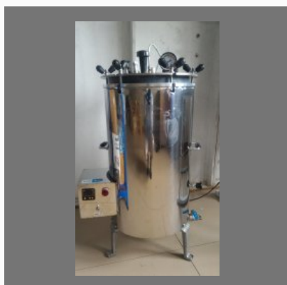
Inner & Outer SS 304 Vertical Autoclave