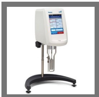
LVDVE Brookfield Viscometer