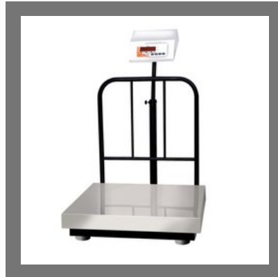
Digital Platform Weighing Scale