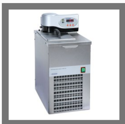
Circulating Refrigerated Water Bath