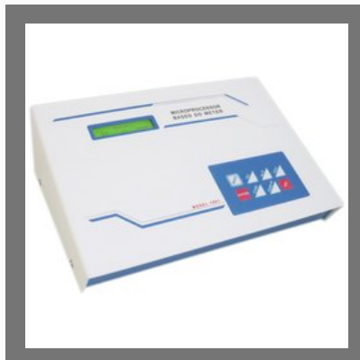
1801 Dissolved Oxygen Meter