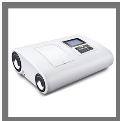
Double Beam UV Visible Spectrophotometer