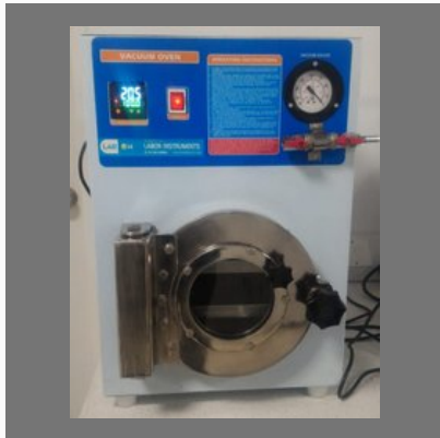
VACUUM OVEN - RECTANGULAR