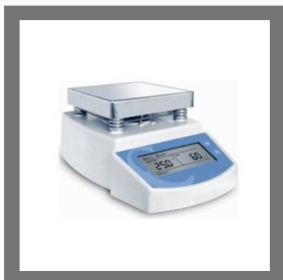
Hotplate Magnetic Stirrer