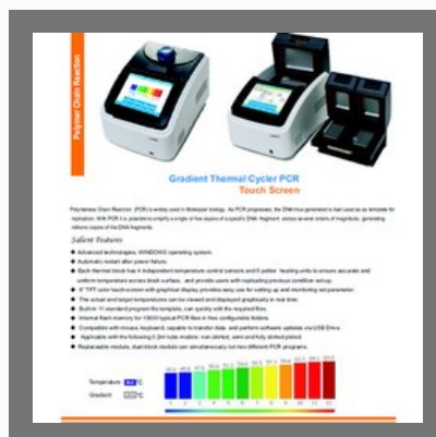
PCR Thermal Cycler