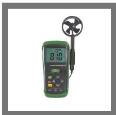
Digital Thermo Anemometer