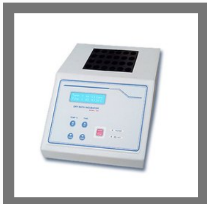
Digital Dry Bath Incubator Laboratory