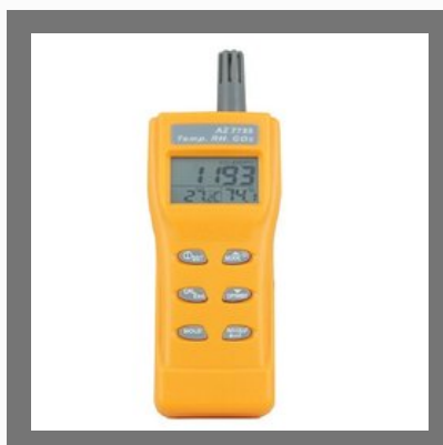
CO2 Detector Humidity Dew Point Temperature Detection RH Temp CO2 Tester