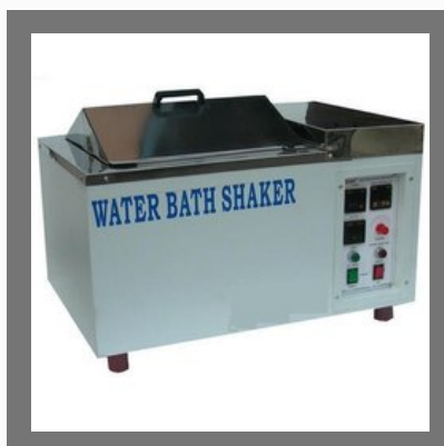
Labon Water Bath Incubator Shaker