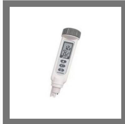
Pocket PH Meter