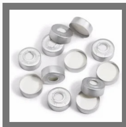
20 mm Aluminum Crimp cap