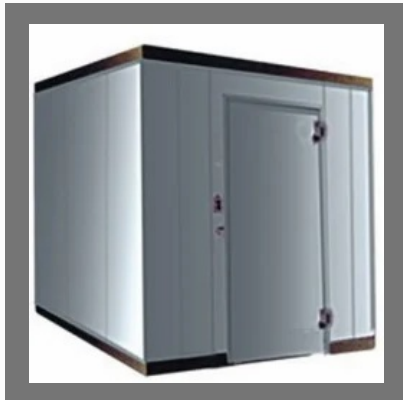
Walk In Chamber