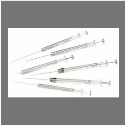
700 Series Micro Liter Syringes