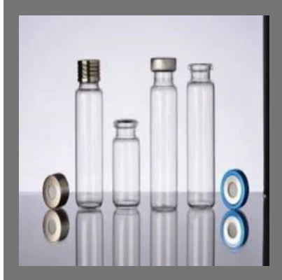
20 MI Clear Glass Round Bottom Vial

with silicon PTFE septa for 20 ml GC vial