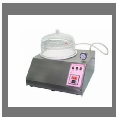
Leak Test Apparatus