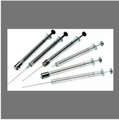
1700 Series Gas Tight Syringes