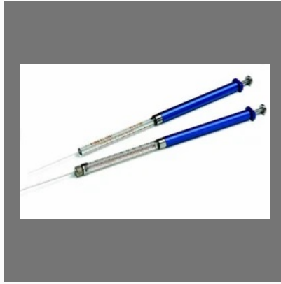
800 Series Micro Liter Syringes