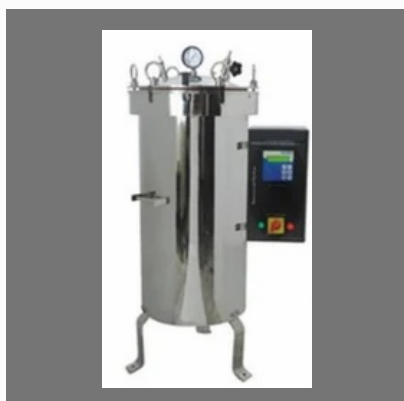
Autoclave Steam Sterilizer