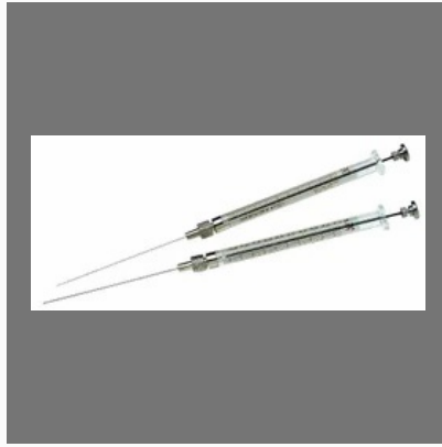
7000 Series Modified Micro Liter Syringe