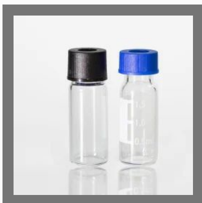
Halc 2 MI /1.5 MI Vials With