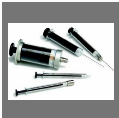
1000 Series Microliter Syringes Gas Tight