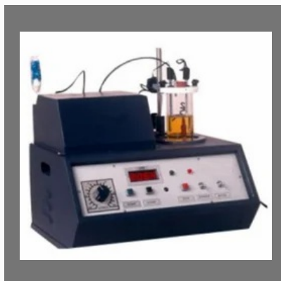
Digital Karl Fischer Titrator APP