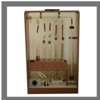
Orsat Gas Analysis Apparatus