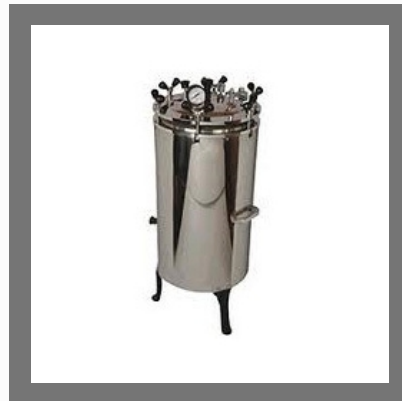
Autoclaves Lab Equipments