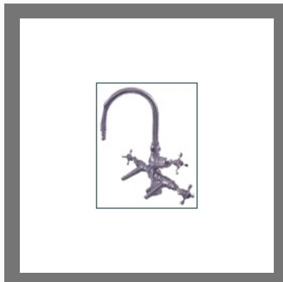
3 Way Laboratory Cock