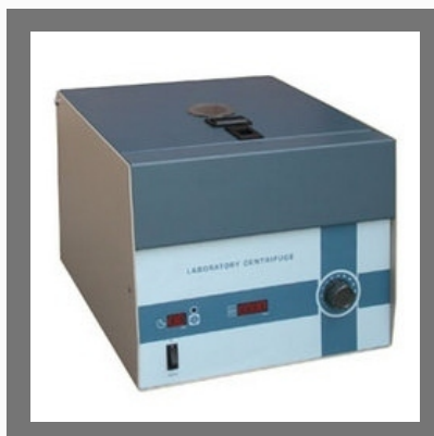
Digital Laboratory Centrifuge