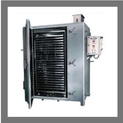
LASIN Tray Dryer