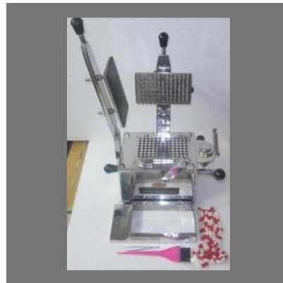
Pharmacy College Lab ( Complete ) For New Colleges