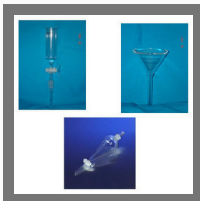
Separating, Cylindrical, Powder Funnel