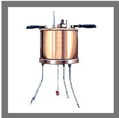
Saybolt Viscometer Apparatus