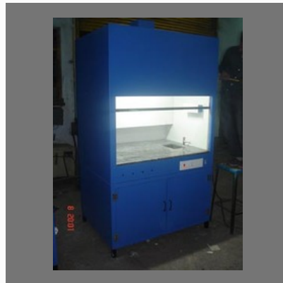
Ductless Fume Hood