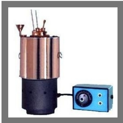
Abel's Flash Point Apparatus