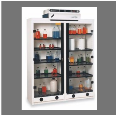
Vented Chemical Storage Cabinet