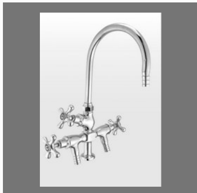
2 Way Laboratory Cock