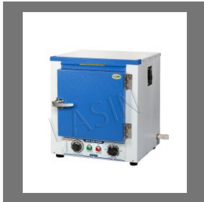
LASIN Laboratory Hot Air Oven