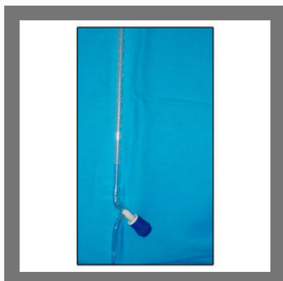
Glass Ware Burettes