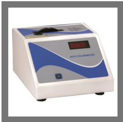
LASIN Photo Colorimeter