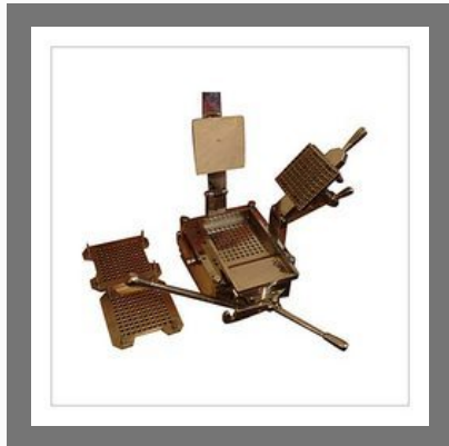
Manual Capsule Filling Machine