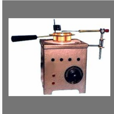
Engler Viscometer Apparatus