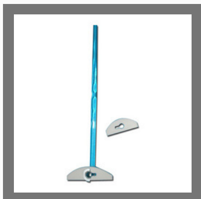
PTFE Bladed Stirrers