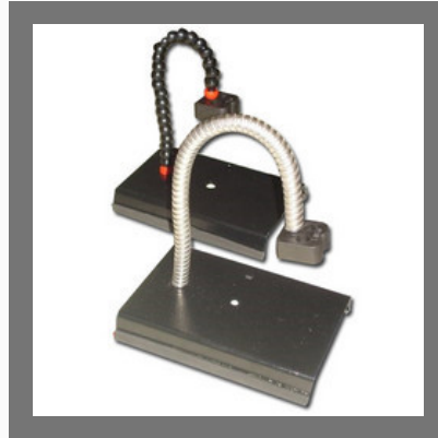
Multi Purpose Flexible Stand