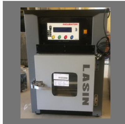
Incubator Lab Equipments