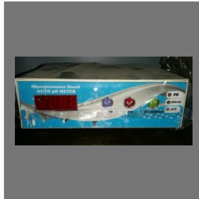
LASIN PH Meter