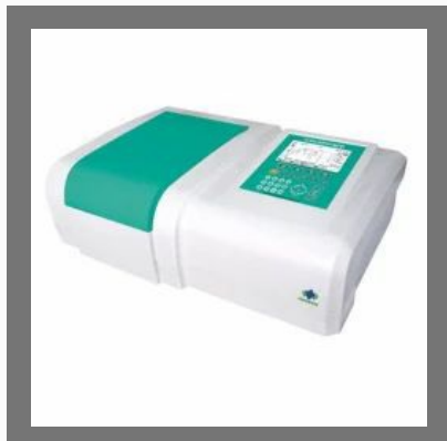
Double Beam UV-Visible Spectrophotometer