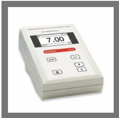
Bench Top PH Meters