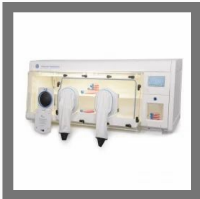
Hypoxia Cell Culture Workstation