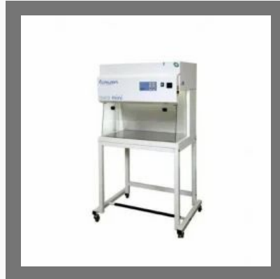
Vertical Mini Laminar Flow Cabinet