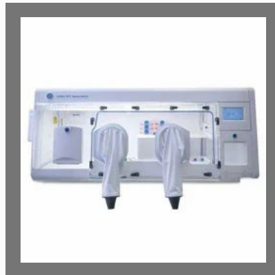
Hypoxia Incubator Chamber