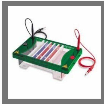
Horizontal Drive Units