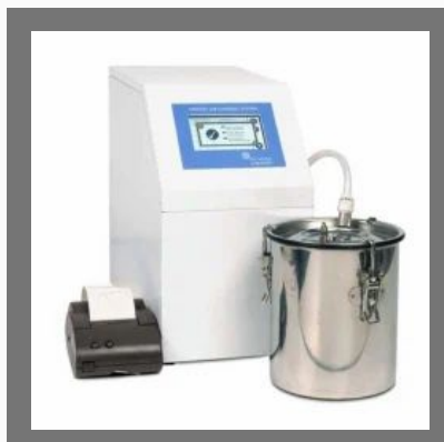
Whitley Automated Anaerobic Jar Filling System