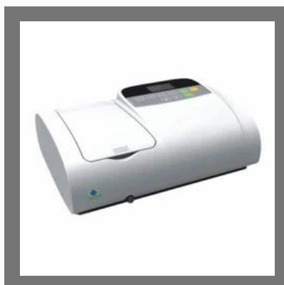
Single Beam UV- Visible Spectrophotometer