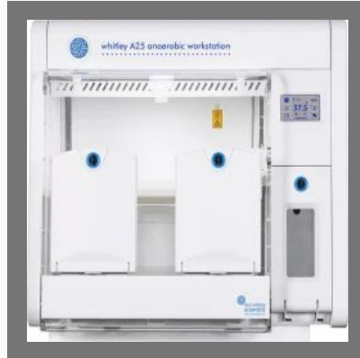
Don Whitley Anaerobic Workstation Model A-25