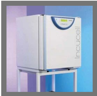
Incubator- incu Cell-v