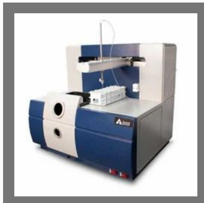
Atomic Absorption Spectrometer