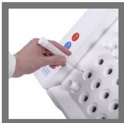
Whitley Rapid Automated Bacterial Impedance Technique