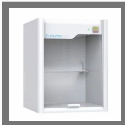
Uv Pcr Cabinets And Workstations