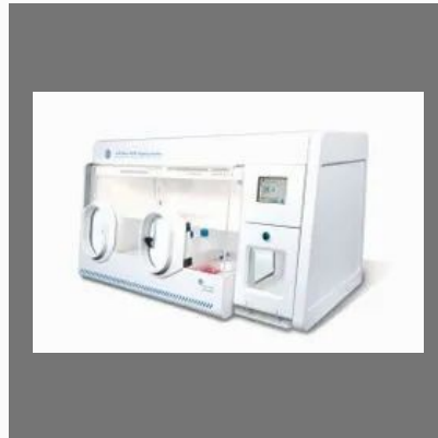
Don Whitley Hypoxia Workstation