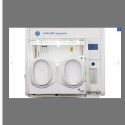
Don Whitley Hypoxic Cell Culture System