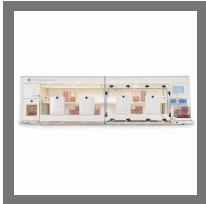
Don Whitley Anaerobic Workstation