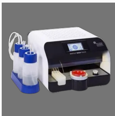
Don Whitley Spiral Plater Laboratory Equipment