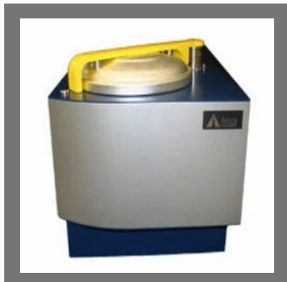
Microwave Digestion System