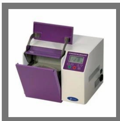
Stomacher Laboratory Blender