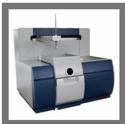
Atomic Absorption Spectrophotometers