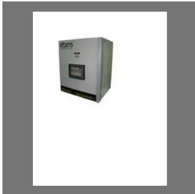
Flow Culture Bioreactor