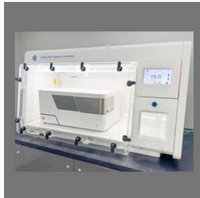
Don Whitley Anaerobic Workstation Chamber