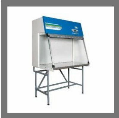
Laminar Air Flow Cabinets