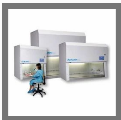
Biosafety Cabinet Safe Mate