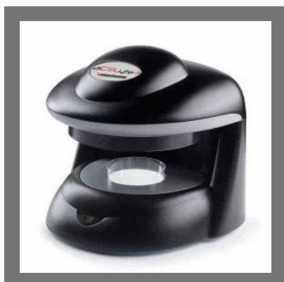
Whitley Automated Colony Counting System