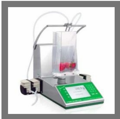
Gravimetric Dilutors Analyzer