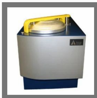
Microwave Digestion System