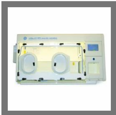
Whitley HEPA Anaerobic Workstation