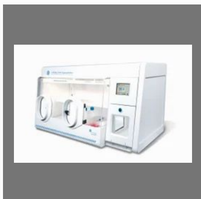
Whitley Cell Culture Hypoxia Workstation