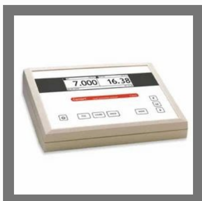
Ion Concentration Meter