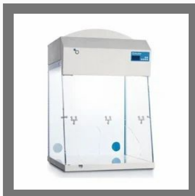
Laboratory Fume Hood