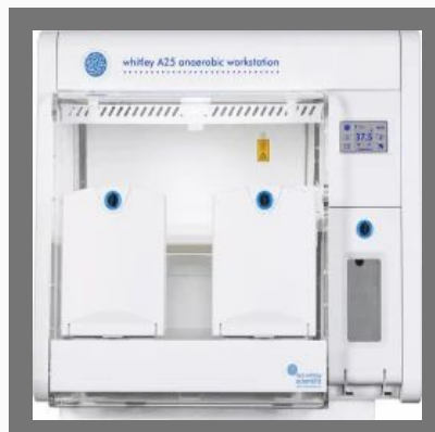
Whitley Anaerobic Workstation