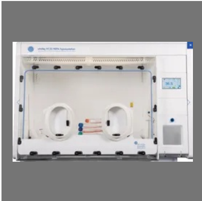
Whitley Hypoxic Chamber