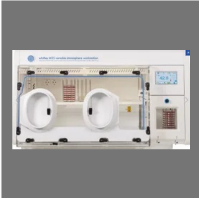
Don Whitley Microaerophilic Workstation