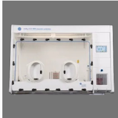
Whitley Microaerophilic Atmosphere