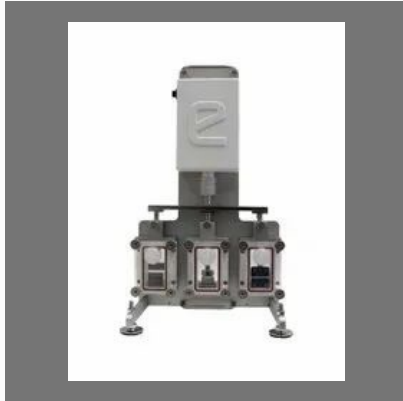
TC3 Bioreactor for Pharma