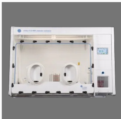
Whitley Anaerobic Chamber