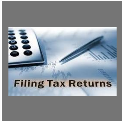
IT Return Filing