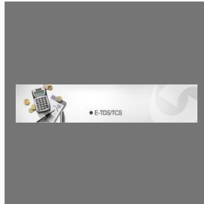
TDS / TCS