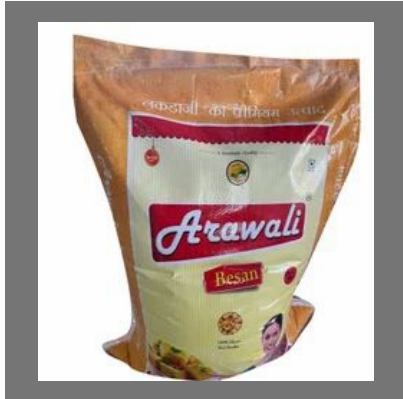
25 Kg Arawali Besan Flour