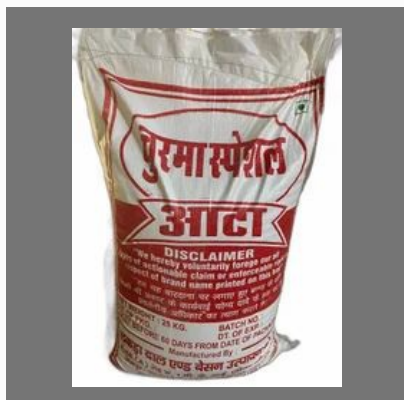
25Kg Churma Special Atta