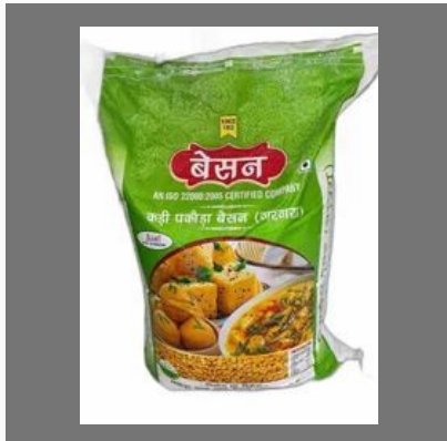
Besan Kadhi Pakoda