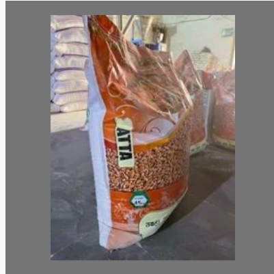
45 Kg Arawali Wheat Flour