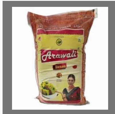
25 Kg Arawali Besan Flour