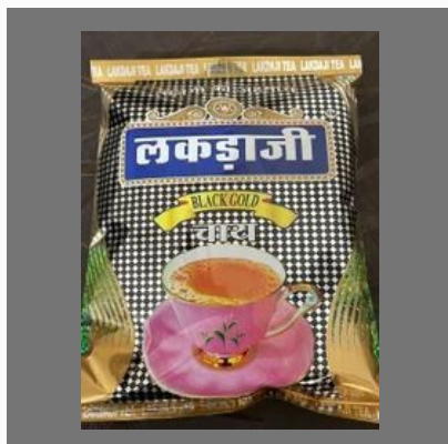
Lakdaji Black Gold Tea