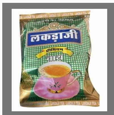
Lakdaji Premium Tea