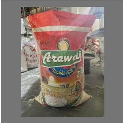
45 Kg Arawali Chakki Atta