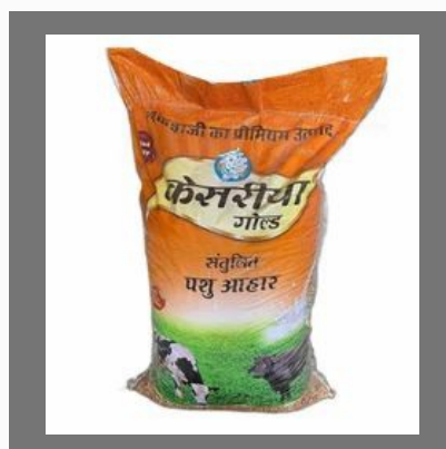
Kesriya Gold Pashu Ahar