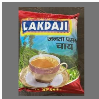
Lakdaji Janta Pasand Tea