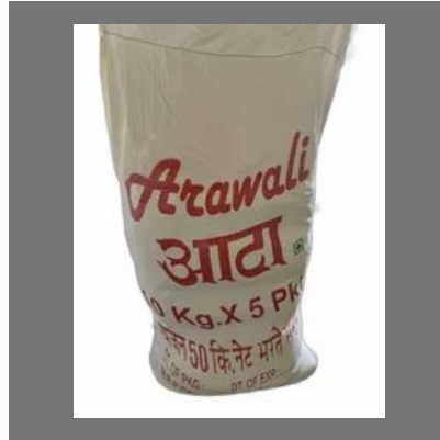
50 Kg Arawali Wheat Flour