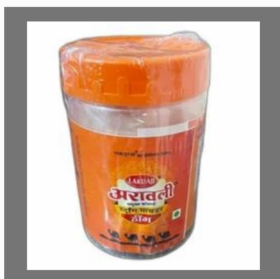
Arawali Compounded Asafoetida Strong Hing