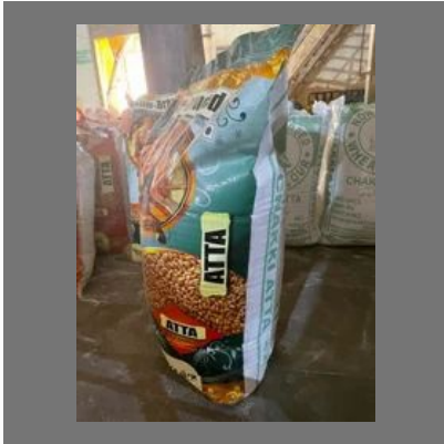
50 Kg Arawali Wheat Flour