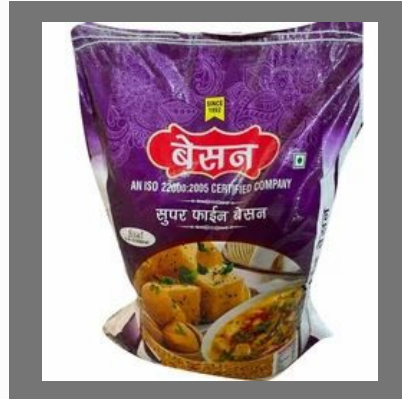
Super Fine Besan