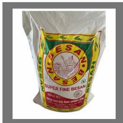
30Kg Besan Super Fine