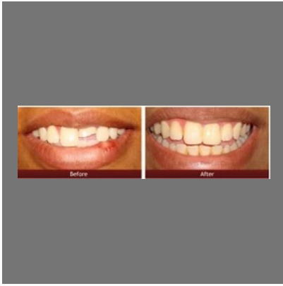
Smile Makeover Service