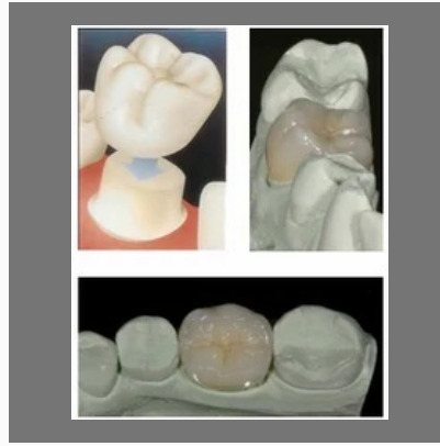
Root Canal Treatment Service