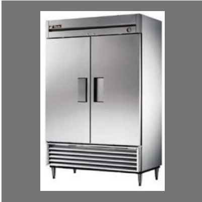
Two Door Freezer