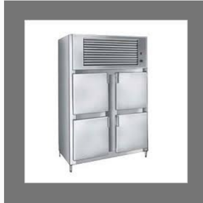
Four Door Refrigerator