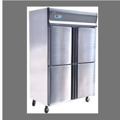
Four Door Freezer