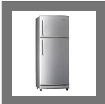
Two Door Refrigerator