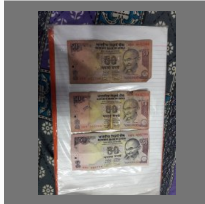
Unique Serial Number Last No-786 50 Rs - 3 Notes