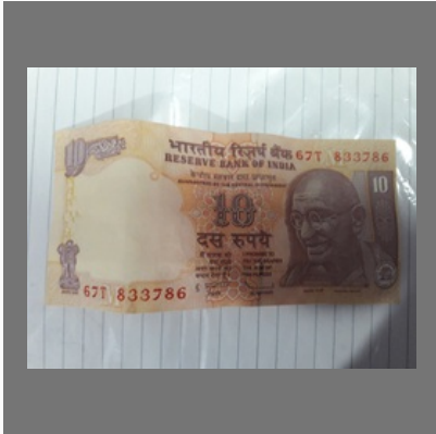
Unique Serial Number Last No-786