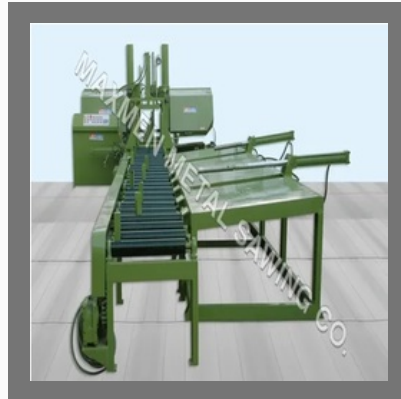
Fully Automatic Double Column Band Saw Machine