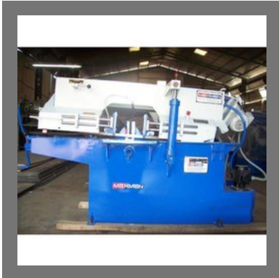
LX-1 STD Swing Type Band Saw Machine