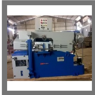
Automatic High Speed Metal Cutting Band Saw Machine