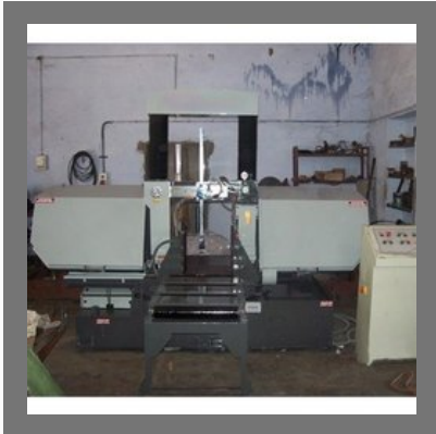
Double Column Metal Cutting Band Saw Machine