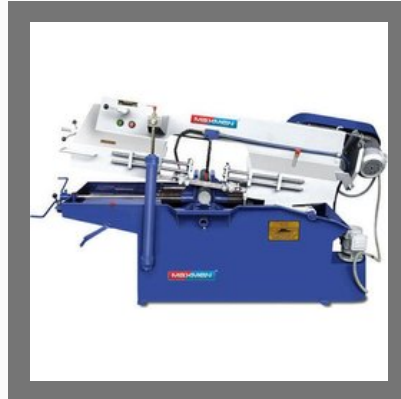
LX-4 HS Pivot Type Horizontal Metal Bandsaw Machine