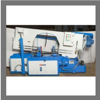
LX-300 DCA High Speed Metal Cutting Band Saw Machine