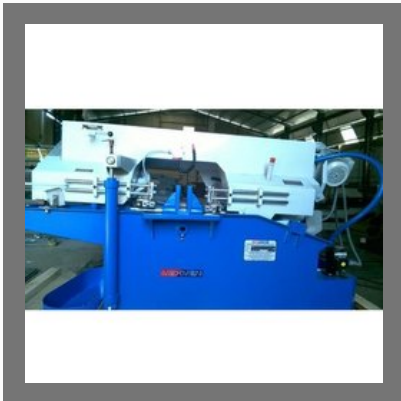
LX-10 HS Pivot Type Horizontal Metal Bandsaw Machine