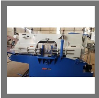
LX-3 HS Pivot Type Horizontal Metal Band Saw Machine