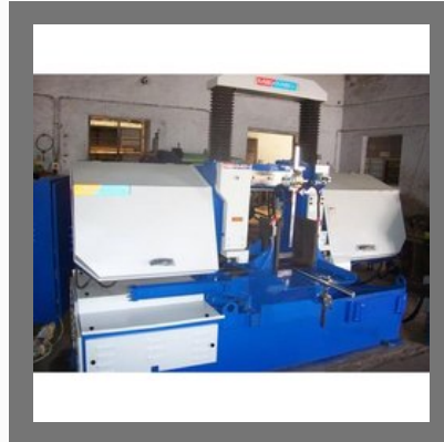
Double Column Horizontal Band Saw Machine