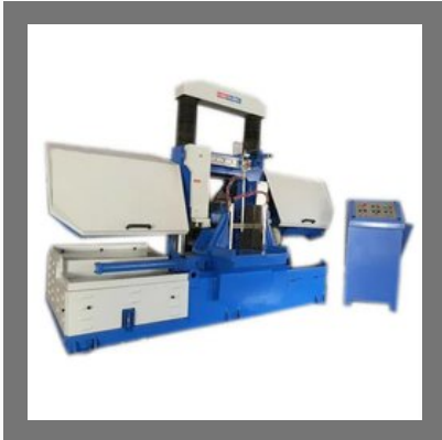
Double Column Horizontal Metal Cutting Band Saw Machine