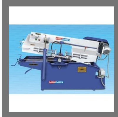
LX-1 HS Swing Type Band Saw Machine