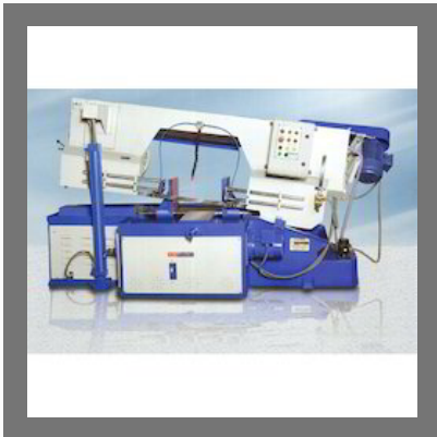
LX-300 DC High Speed Metal Cutting Band Saw Machine