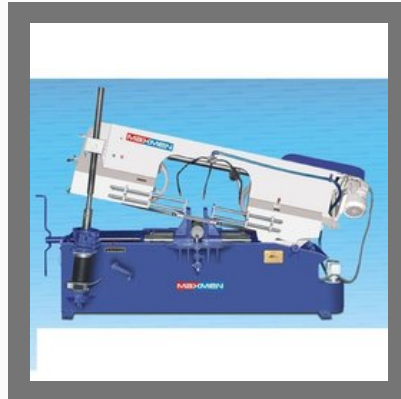
LX-6 HS Pivot Type Horizontal Metal Bandsaw Machine