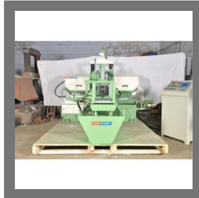
LX-400 DCA High Speed Metal Cutting Band Saw Machine