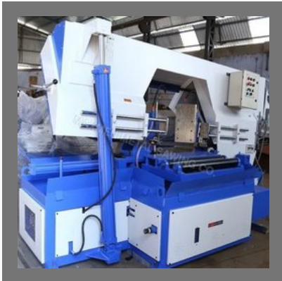
Semi Automatic Double Column Metal Band Saw Machines