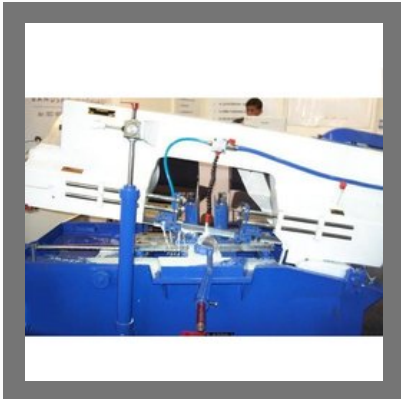
Swing Type Band Saw Machine