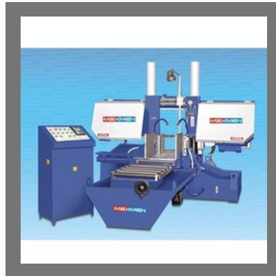
LX-400 DC High Speed Metal Cutting Band Saw Machine