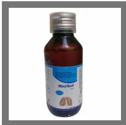
Mistikof Dry Cough Syrup, 100 ml