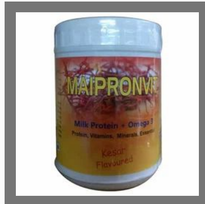
Milk Protein Powder Saffron