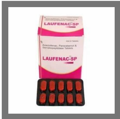
Laufenac SP Tablet