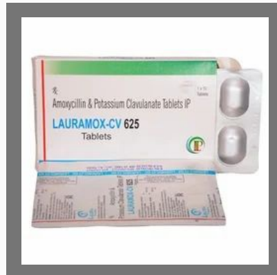
Lauramox-CV 625 (Amoxycillin Potassium Clavulanate )Tablet