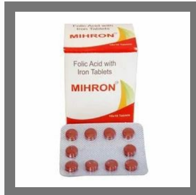
Iron folic acid Tablet