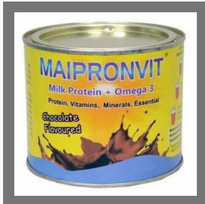
Milk Protein Powder Chocolate