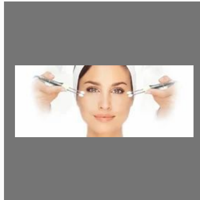
NonSurgical Face and Neck Lifting, Body Contouring