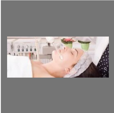
Ultrasonic Hair Removal