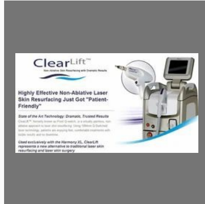
Clear Lift Laser Toning, Tattoo Removal, Pigmentation Treatme