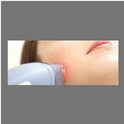
Laser Hair Reduction