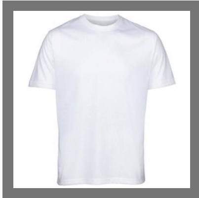
Mens White Half Sleeve T-Shirt