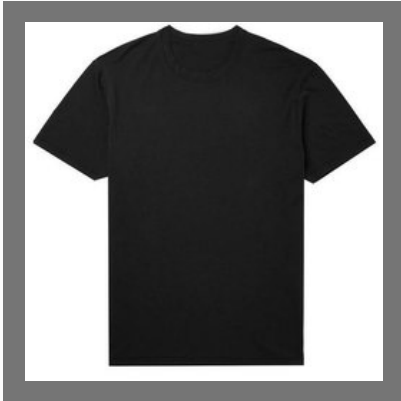
Mens Black Half Sleeve T-Shirt