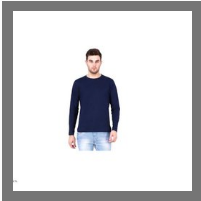
Mens Blue Full Sleeve T-Shirt