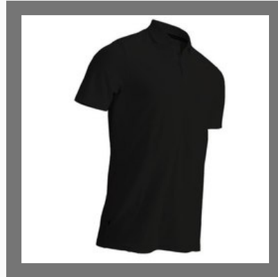
Mens Black Polo T-Shirt