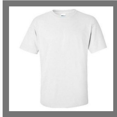
Mens White Plain T-Shirt