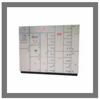
Electrical Control Panel Board