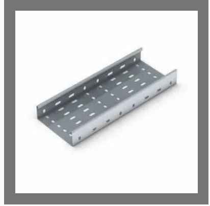
Galvanized Coating Cable Tray