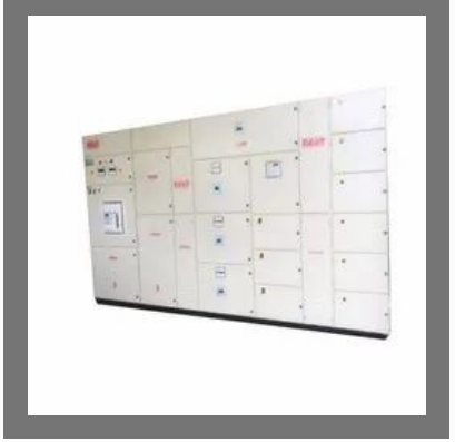
DG Synchronization Control Panel