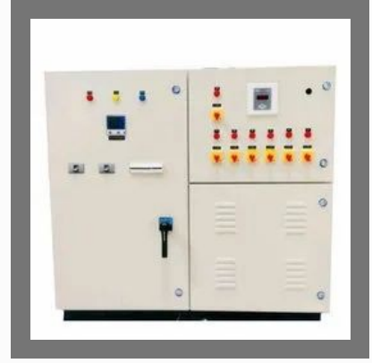
Three Phase Control Panel Board