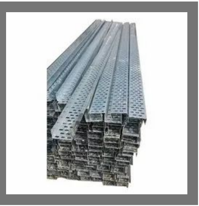
U Shape Perforated Cable Tray