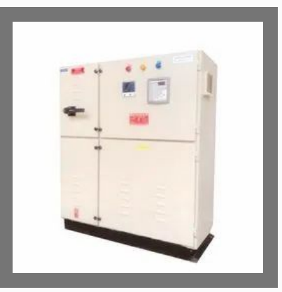
Single Phase VFD Panel