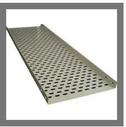
Galvanized Coating Perforated Cable Tray