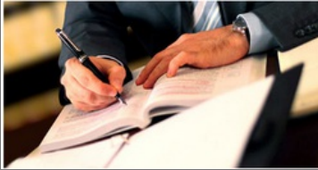
Litigation Related Research Service