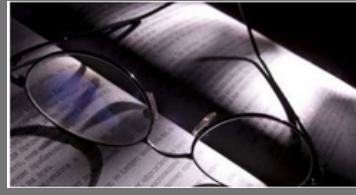
Interpretation And Analysing Of Legal Documents Service