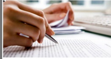
Legal Documents And Pleading Service