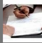
Contracts: Draft, Review, Vetting and Amendments