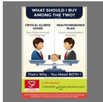
Health Insurance Service