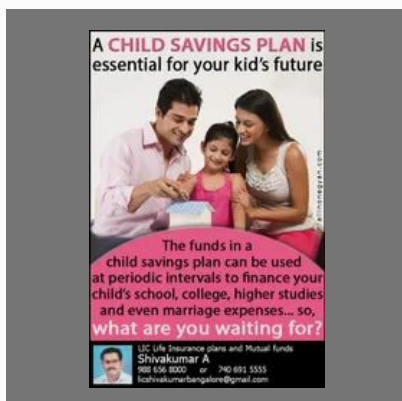
LIC Life Insurance India