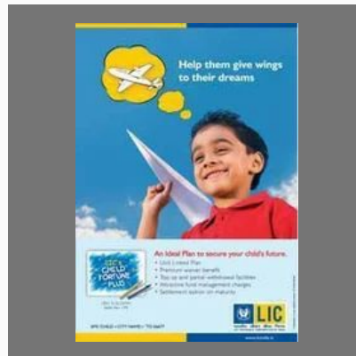
Insurance (Children Education)