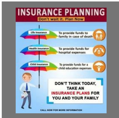
Insurance Plan Service (NRI)