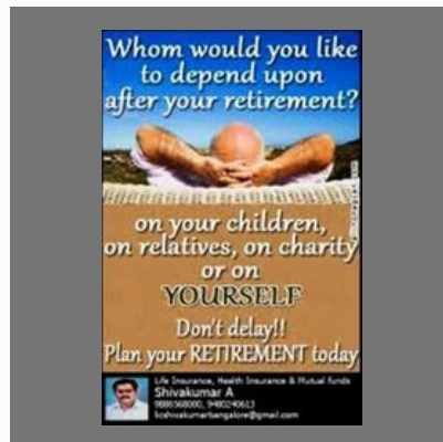
Insurance (Pension Policy)