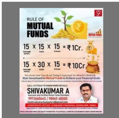
Sip Mutual Funds Services