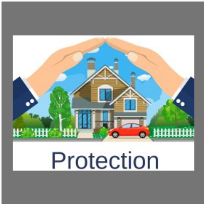
Non Life Insurance Service