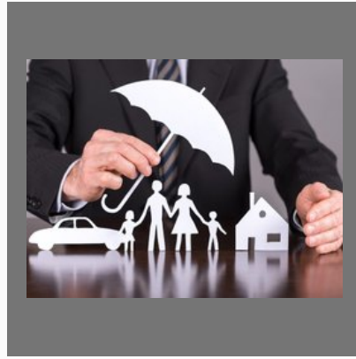
Life Insurance Service