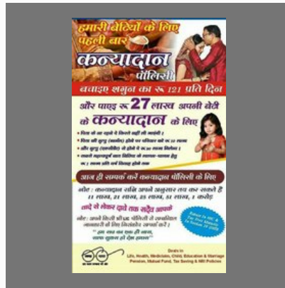
Child Marriage Plan