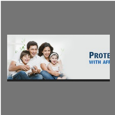
Health Insurance Services