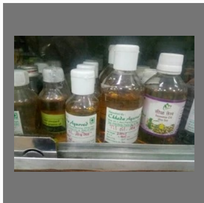
Pain Relief Oil