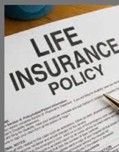
Life Insurance Services