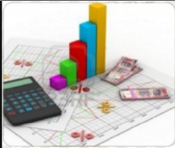
Money Back Plans