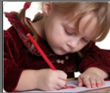
Pure Protection Plans