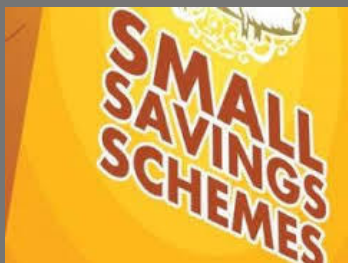
Small Saving Scheme