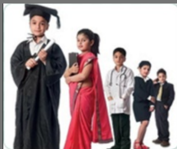
Child Protection Plan