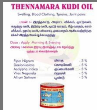
Thennamara Kudi Oil