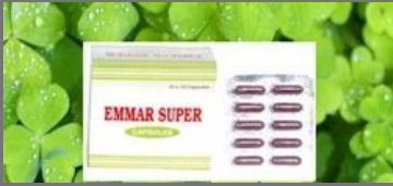
Emmar Super (Capsules)