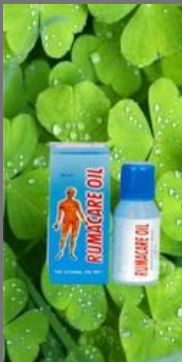
Rumacare Oil (Massage Oil)