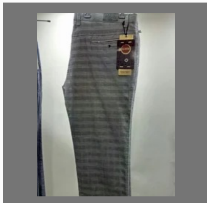
Design Casual Pants