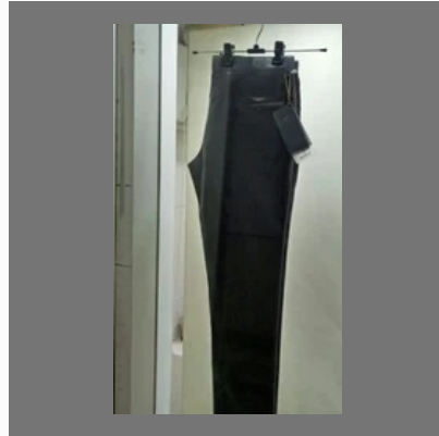
Black Casual Pant