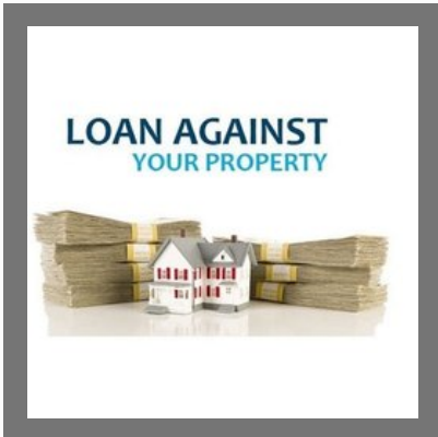
Loan Against Property