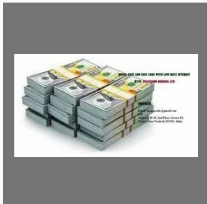
Gold Loan Service