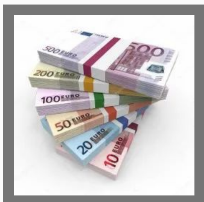
Project Loans Services