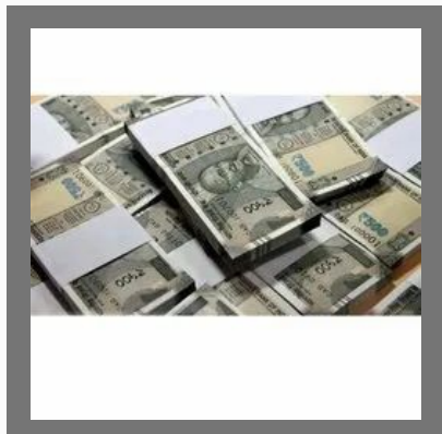
Inter Corporate Deposit Service