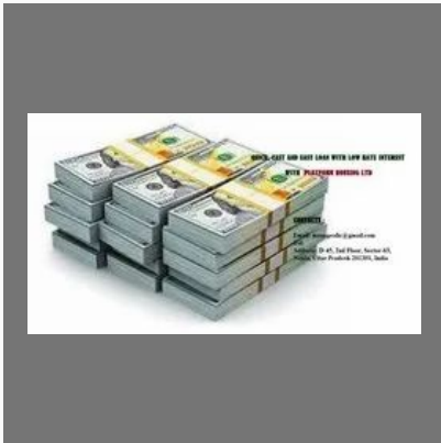
Home Loan Services