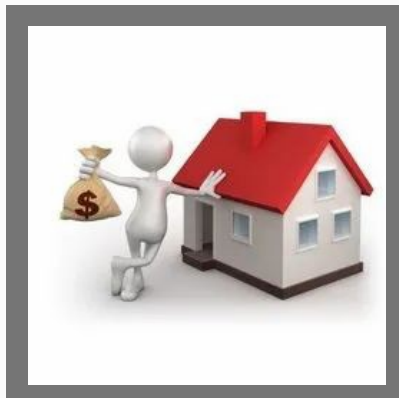
Gold Purchase Loan Services