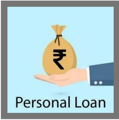
Home Equity Personal Loan