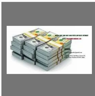
Credit Mortgage Loans