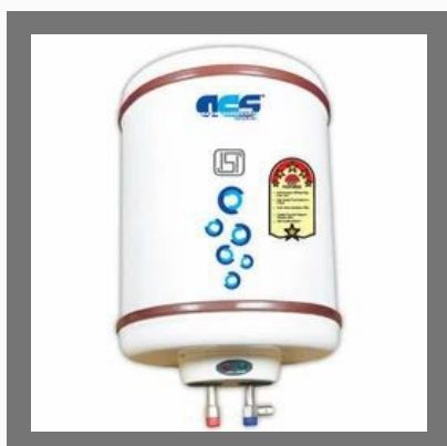
Electric Water Geyser