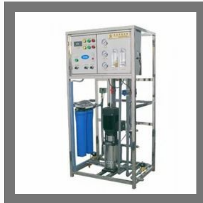
100 LPH Water Purifier