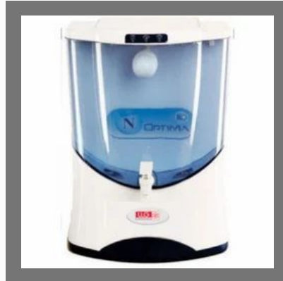
White And Blue Optima RO Water Purifier