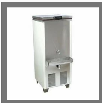
Blue Star Water Cooler