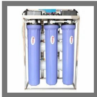
Reverse Osmosis Water Purifier