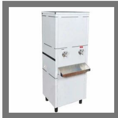
Drinking Water Cooler