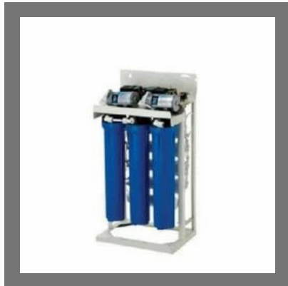
50 LPH Commercial RO Water Purifier