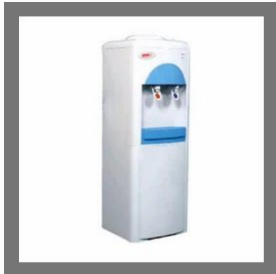
Domestic Water Dispenser