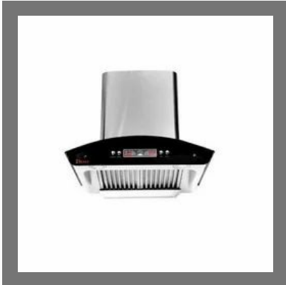
Seavy Kitchen Chimney