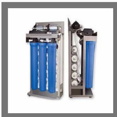
Industrial RO Water Purifier