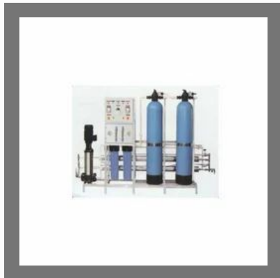
1000 LPH Water Purifier