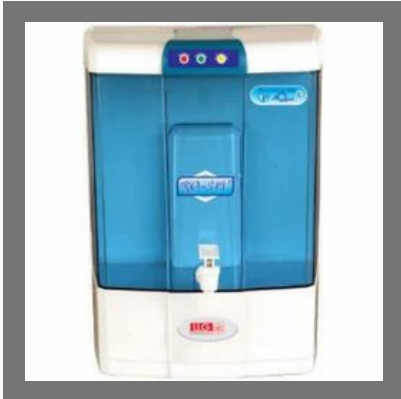
Reverse Osmosis Water Purifier