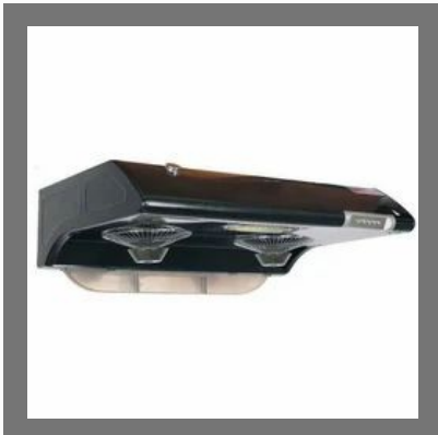
Home Electric Kitchen Chimney