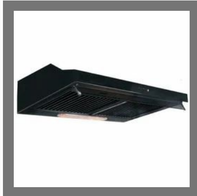
Electric Kitchen Chimney