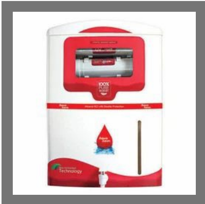
Aqua Nova Water Purifier