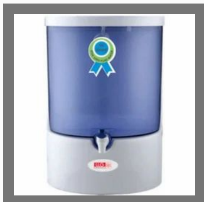
Usha Water Purifier