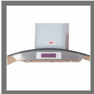
Stainless Steel Kitchen Chimney