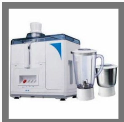
Juicer Mixer Grinder