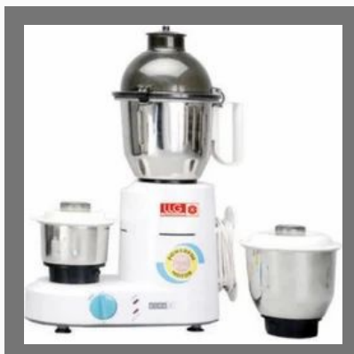
Usha Mixer Grinder