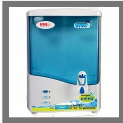
RO Aviva Undersink Water Purifier