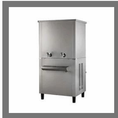
Stainless Steel Water Cooler