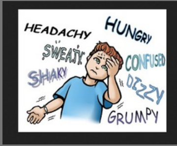
Low Blood Sugar Services