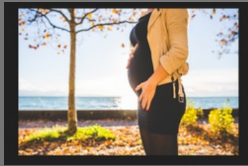
Pregnancy And Diabetes Treatment