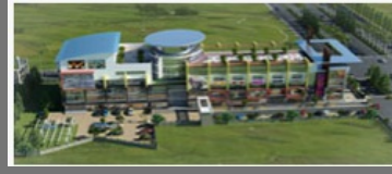
Commercial Building Construction Service