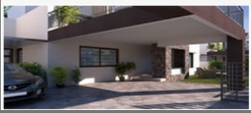
Residential Building Construction Service