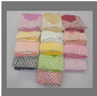
Chikankari Georgette Dress Materials