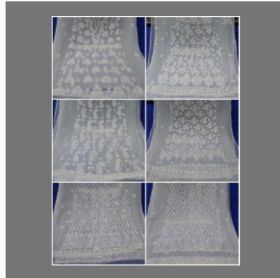
Lucknowi Chikankari Unstitched Georgette Dress Material