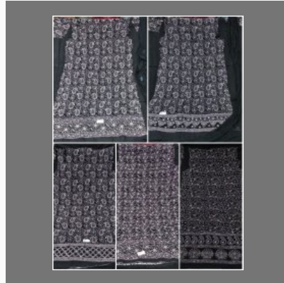
Black Cotton Dress Materials