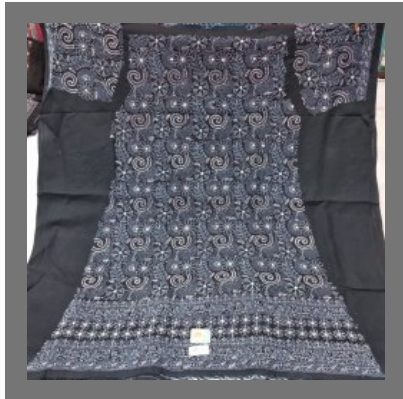
Black Color Cotton Dress Materials