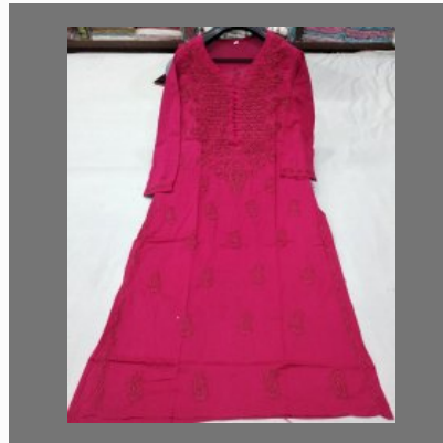
Pure Cotton Embroidered Kurti