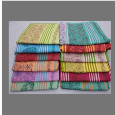
Chikankari Cotton Saree