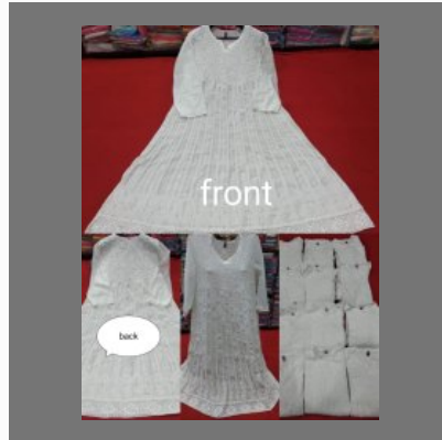
White Cotton Anarkali