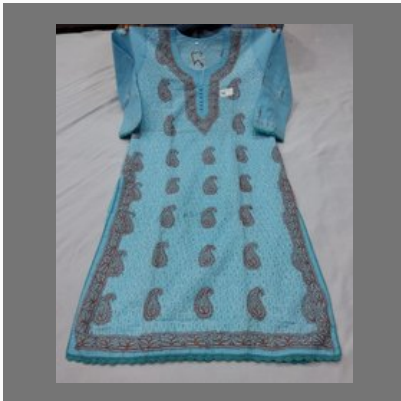
Ladies Long Chikankari Kurti