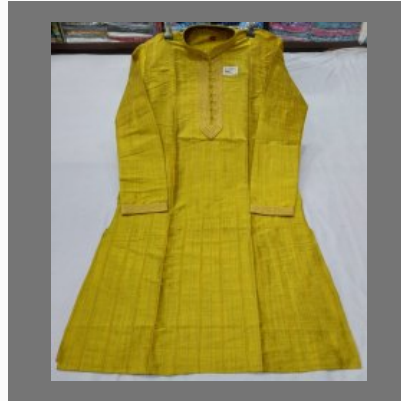
Men Party Wear Kurta