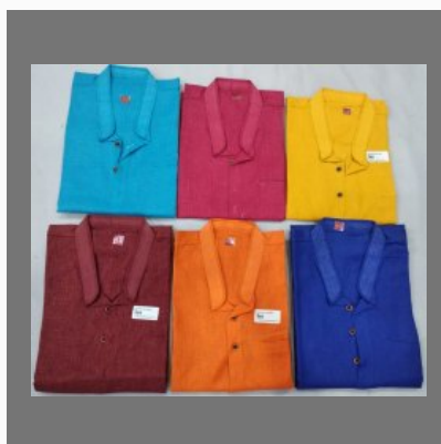
Mens Linen Kurta