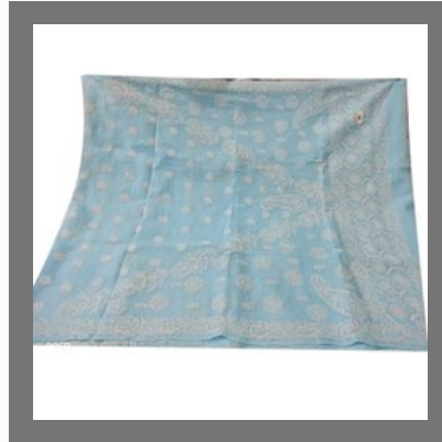
Ladies Chikankari Cotton Bordered Saree