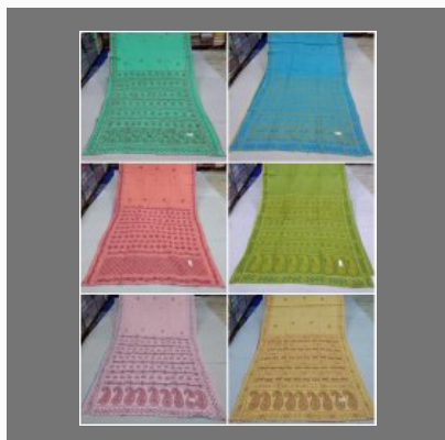
Lucknowi Chikankari Cotton Saree