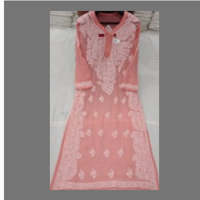
Lucknow Chikan Kurti