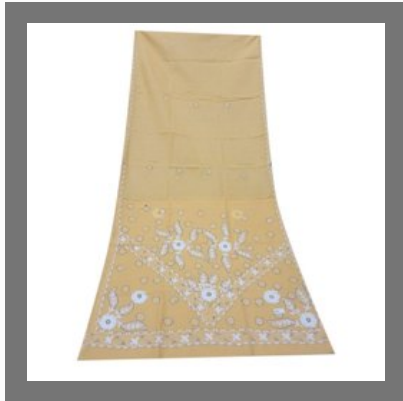
Ladies Cotton Chikan Saree