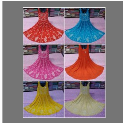
Ladies Rayon Gown