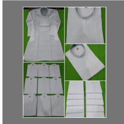
Mens Cotton Kurta