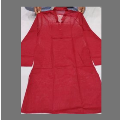
Mens Indo Kurta