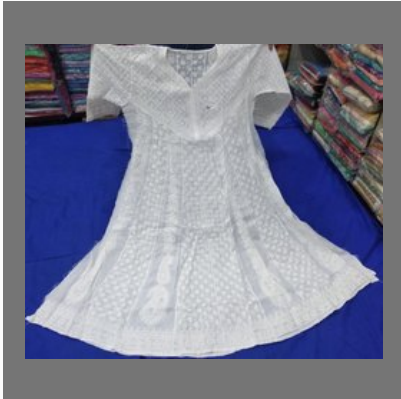
Cotton Chikankari Anarkali Kurti