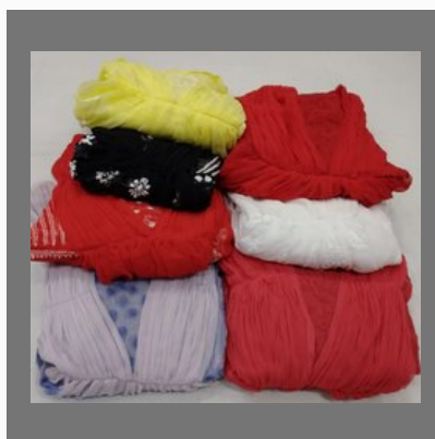
Ladies Chiffon Gown