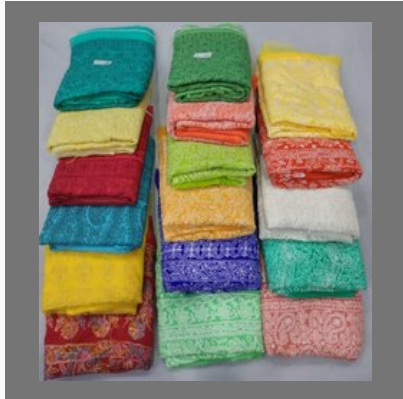
Resham Border Dress Materials