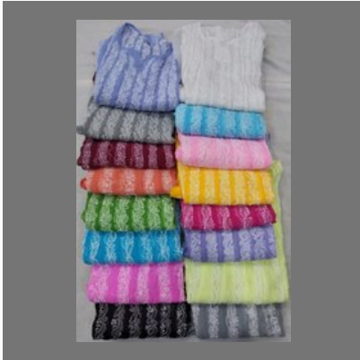
Chikan Anarkali Kurti