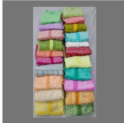
Chiffon Anarkali Kurti