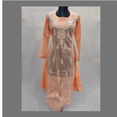
Lucknow Chikan Embroidered Kurti