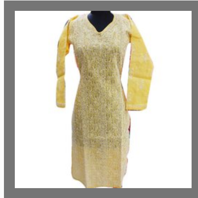
Long Cotton White Thread Embroidered Kurti