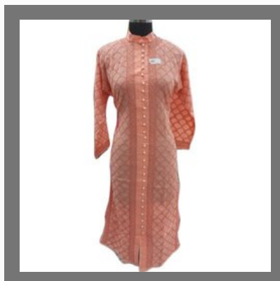
Cotton Moti Button Front Open Style Kurti