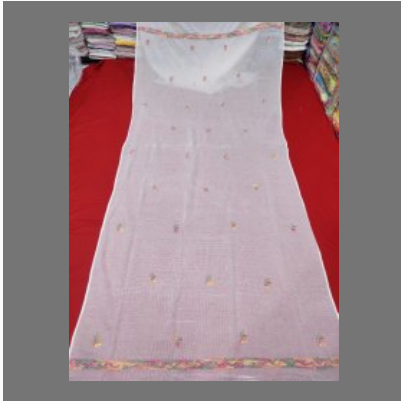
Kota Doria Dress Material