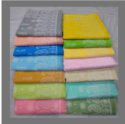
Malmal Cotton Saree