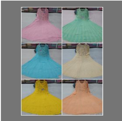
Viscose Anarkali Suits