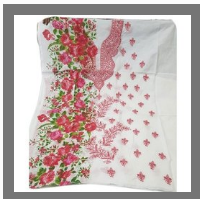
Cotton Embroidered Unstitched Suit