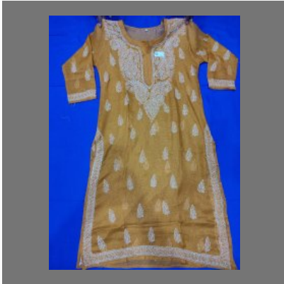
Long Kurti, Kota Cotton Fabric, With Neck Booti Embroidered, Fine Chikankari