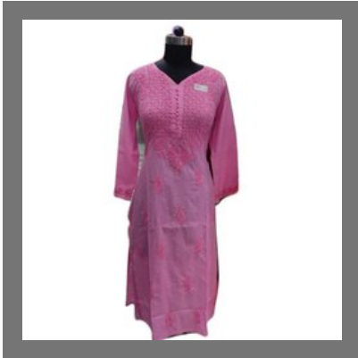
Long Malmal Cotton Kurti