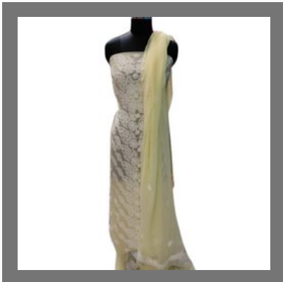
Ladies Chiffon Suit Salwar Material