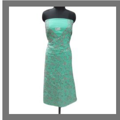
Ladies Cotton Suit Material