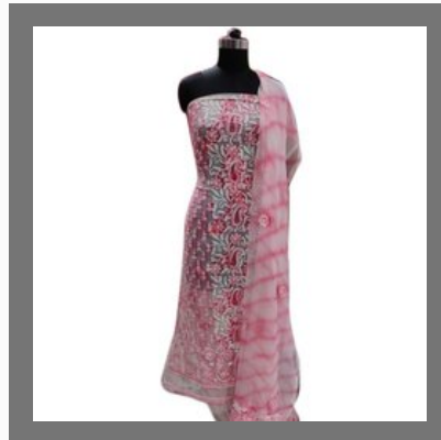
Ladies Chiffon Suit Material