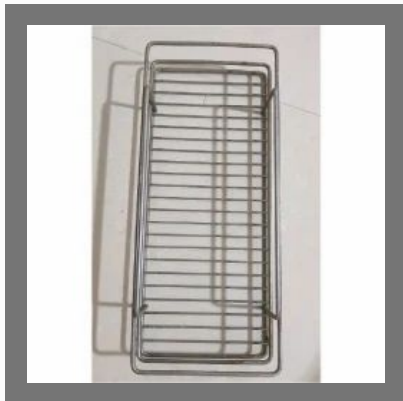
Stainless Steel Cutlery Kitchen Basket