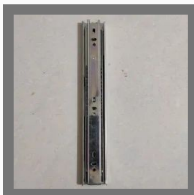
Stainless Steel Telescopic Drawer Channel