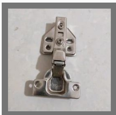
5 Inch Stainless Steel Self Closing Clip On Hinge