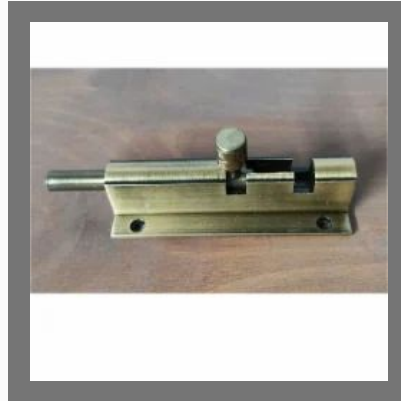
6 Inch Aluminium Tower Bolt