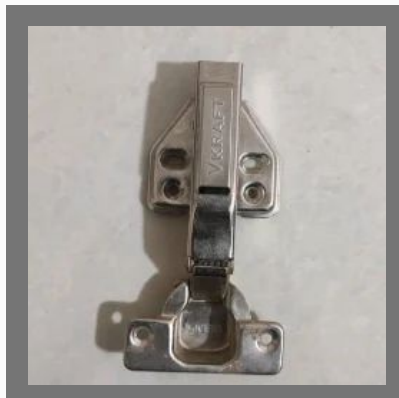
3 Inch Stainless Steel Self Closing Clip On Hinge