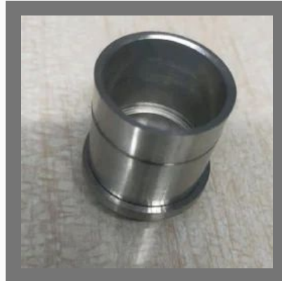
Stainless Steel Round Curtain Bracket