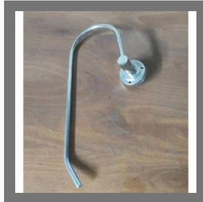
9 Inch Stainless Steel Bathroom Towel Holder