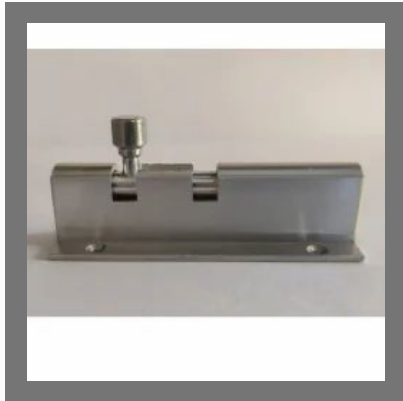
8 Inch Aluminium Window Tower Bolt