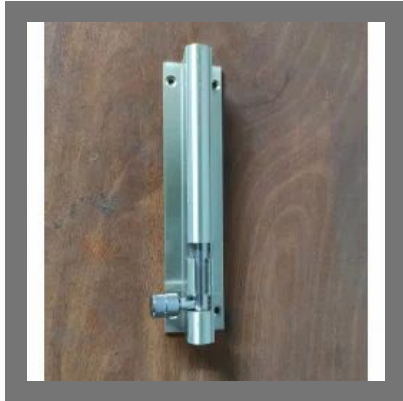
10 Inch Stainless Steel Centre Head Tower Bolt