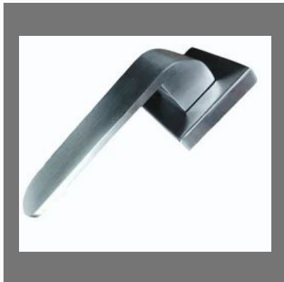
6 Inch Stainless Steel Door Handle