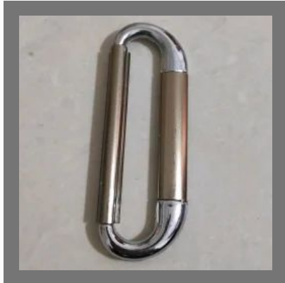
Stainless Steel Folding Door Handle