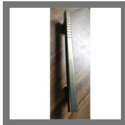
16 Inch Stainless Steel Door Pull Handle