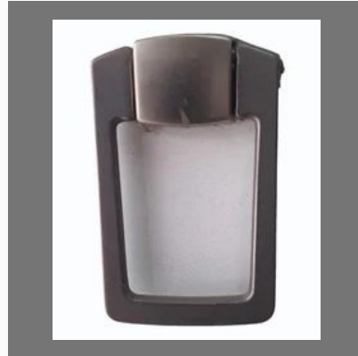
8 inch Stainless Steel Cabinet Concealed Handle