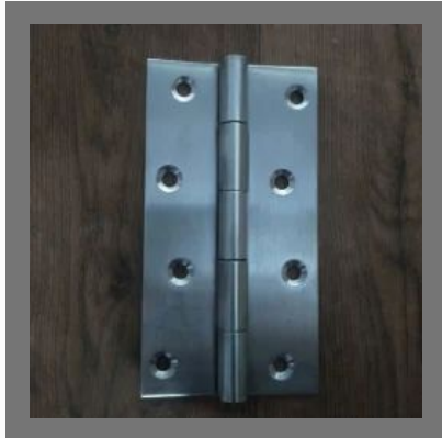
5 Inch Stainless Steel Butt Hinge