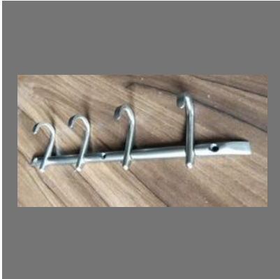
7 Inch Stainless Steel Wall Cloth Hanger