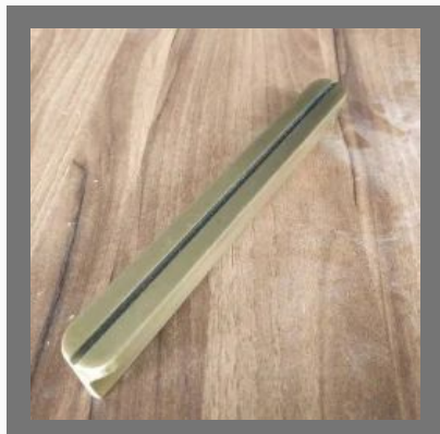
Chrome Finish Stainless Steel Cabinet Handle