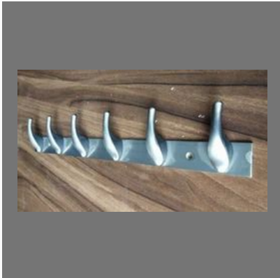
12 Inch Stainless Steel Wall Hanger