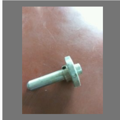
Fire Line Spare Part