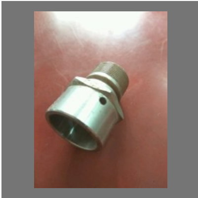
Fire Safety Spare Part