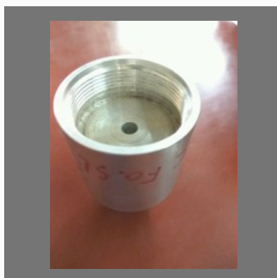
Pneumatic Cylinder Spare Part