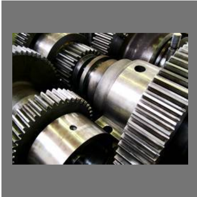
Machining Precision Components