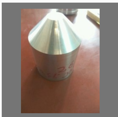
Pneumatic Cylinder Hydraulic Part