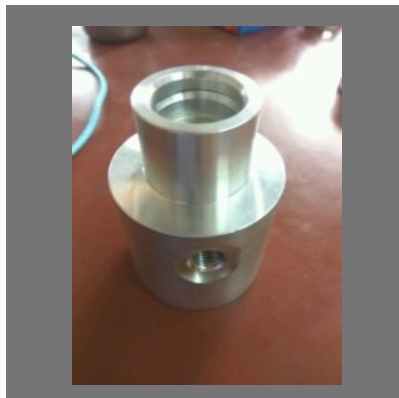
Pneumatic Cylinder Parts