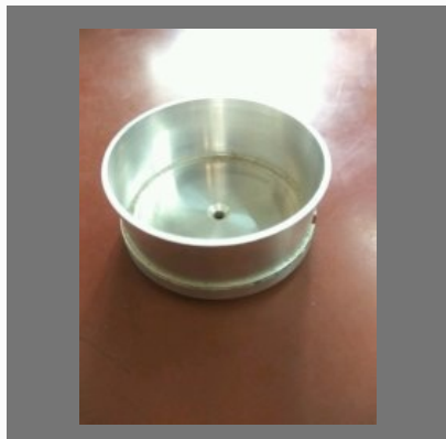
Electronic Weight Machine Parts