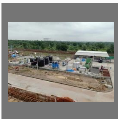
Etp For Automobile Industry