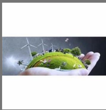
Consent To Operate CCA Certification Service