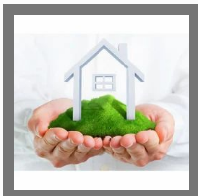
Environment Consultancy Services