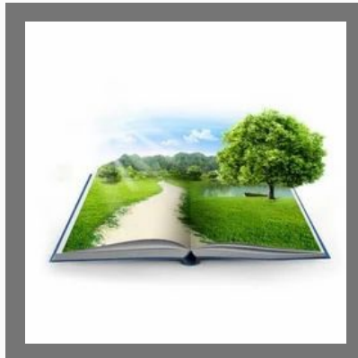
Environmental Audit Service