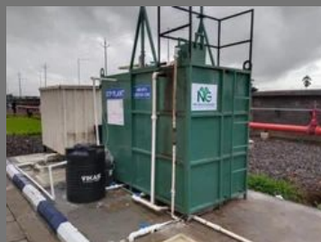
Domestic Sewage Treatment Plant