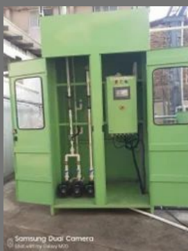
Industrial Sewage Treatment Plant