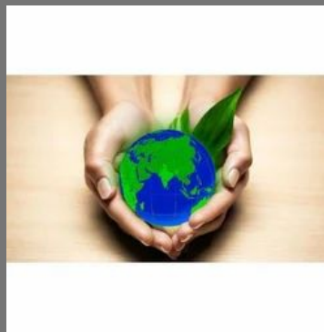
Consent To Establish NOC Certification Service