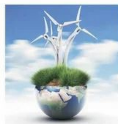
E-Waste Dismantling & Recycling License Registration