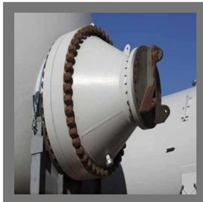
Environment Inspection Audit Service