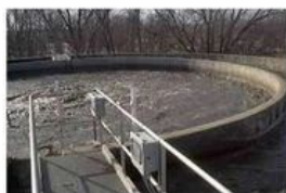
Health & Safety Environmental Audit Service