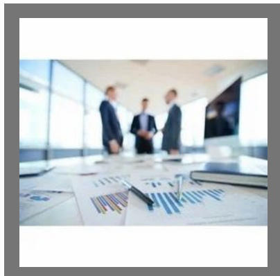
E-Waste Dismantle & Recycling Registration