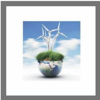
Environment Clearance Certificate Services