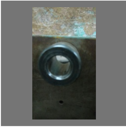
CNC Punch Work