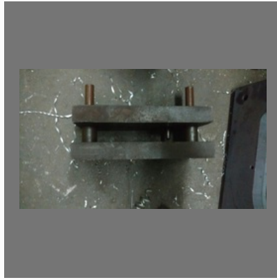
Machined CNC Component