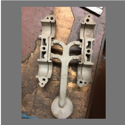
Car Brake Shoe