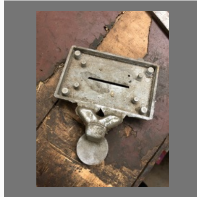
Atm Card Insertor