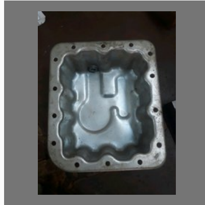
Oil Fan Mould