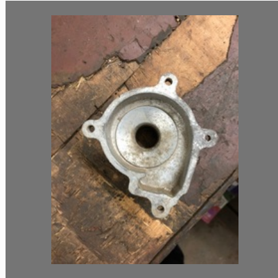
Car Water Pump