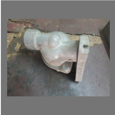
Water Pump Spare