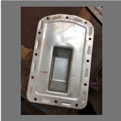
Mini Oil Pans