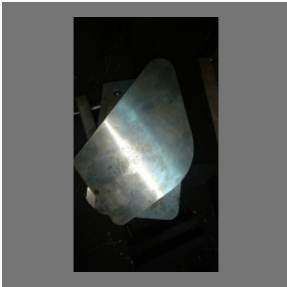
Press Tool Component