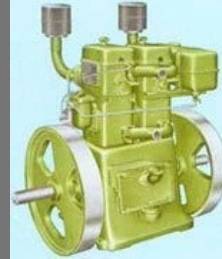
Diesel Engine (double Cylinder)