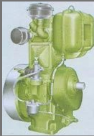
Diesel Engine (water Cooled)