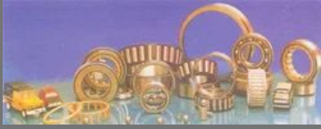
Ball Bearings, Needle Roller Bearings & Taper Roller Bearings