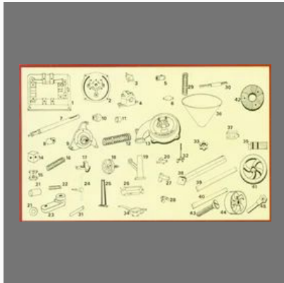
Grinding Mill Spares