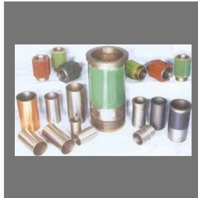
Liners / Sleeves & Blocks