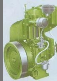
Diesel Engine (air Cooled)