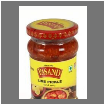
Lime Pickle (Hot And Spicy)