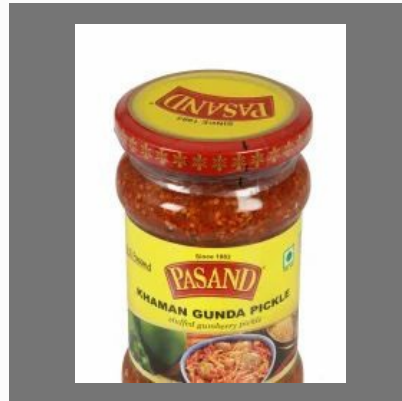
Khaman Gunda Pickle