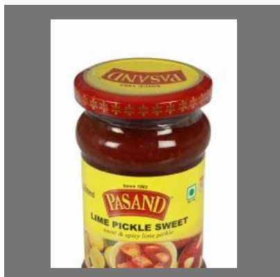
Lime Pickle Sweet