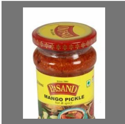
Mango Pickle (Hot And Spicy)