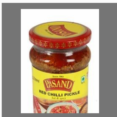
Red Chilli Pickle