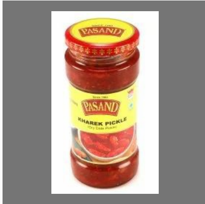
Kharek Pickle (Dry Date Pickle)