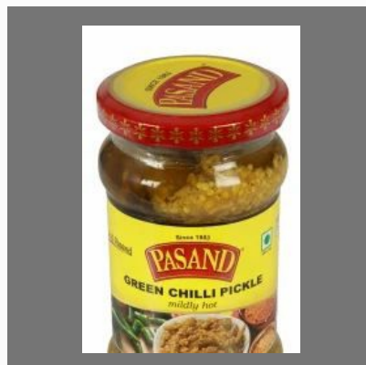
Green Chilli Pickle