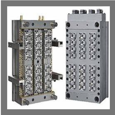
PET Preform Moulds