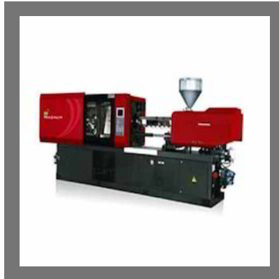
Plastic Injection Moulding Machines