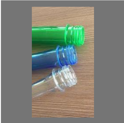
Mineral Water Plastic Bottle Preform