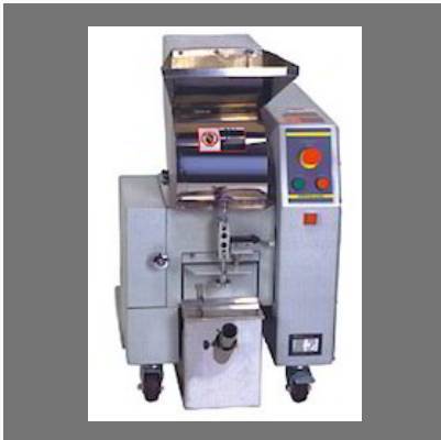
Low Speed Grinders