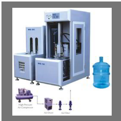
20 Ltr. Blow Moulding Machine