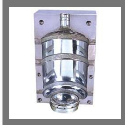
PET Blow Moulds