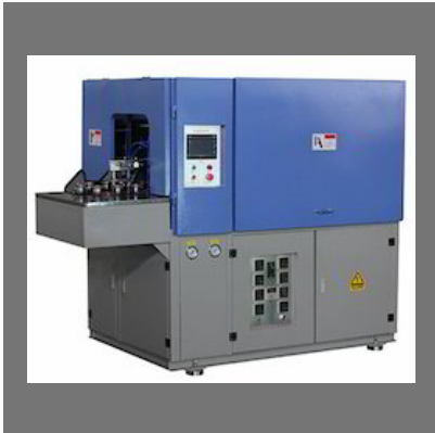
Automatic Hand Fed Pet Stretch Blow Moulding Machine