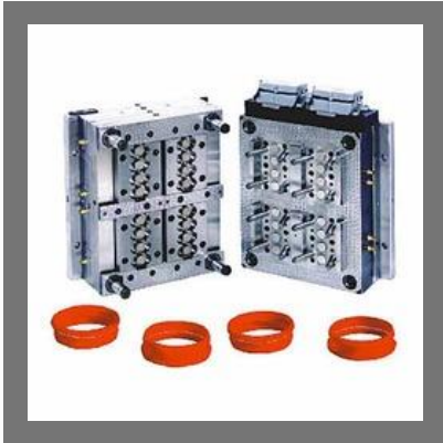
Plastic Injection Moulds