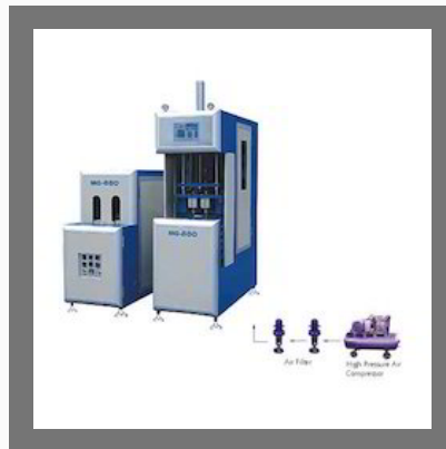
Semi-Automatic Blowing Machines