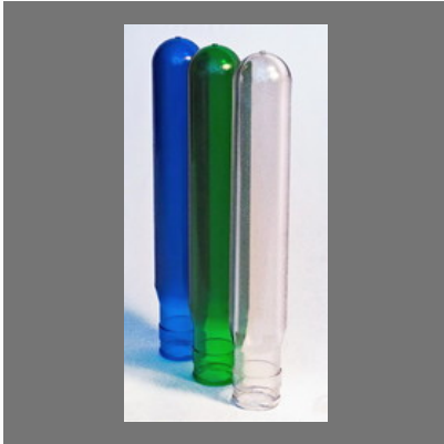
5 Gallon Pet Preform