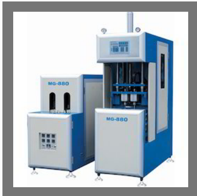
PET Blow Moulding Machines