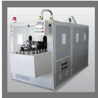
4 Cavity Automatic Hand Fed PET Stretch Blow Moulding Machine