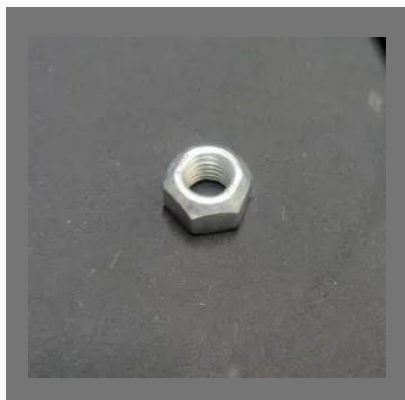
Metal Lock Nuts