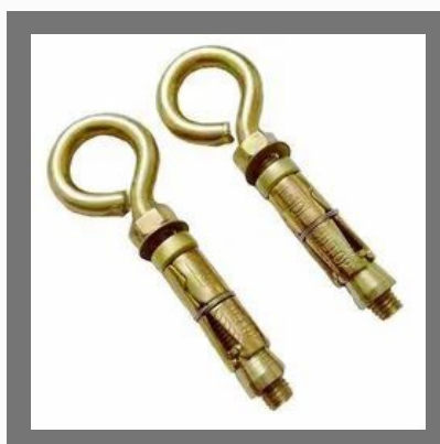
Brass Swing Anchor Bolt