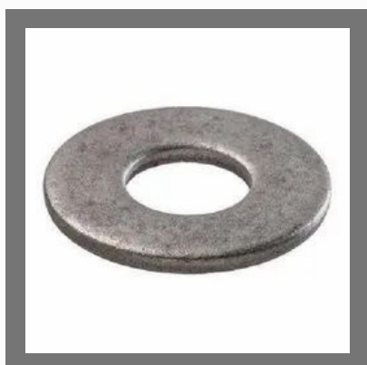
Lead Washer For Chlorine Cylinder