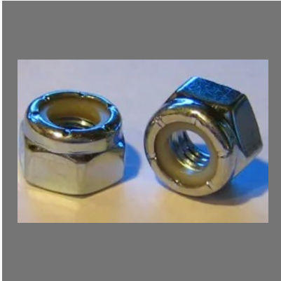
Hex Lock Nut