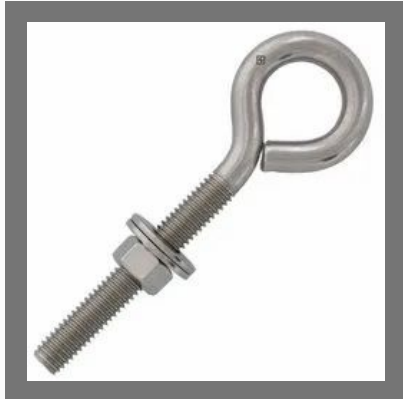
Stainless Steel Eye Bolt