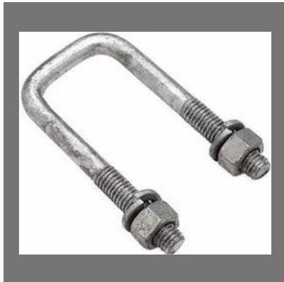
Stainless Steel U Bolt