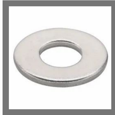
Stainless Steel Round Washer