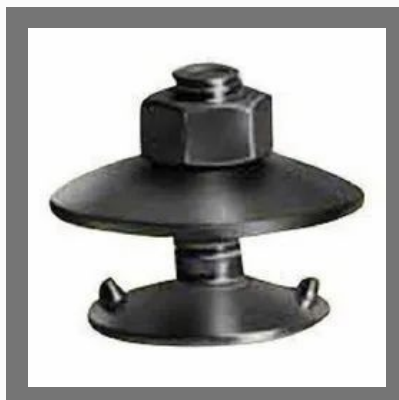
Elevator Bucket Bolts