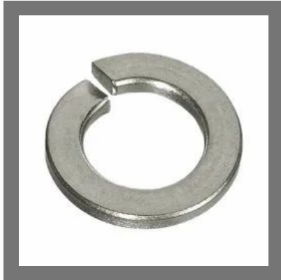
Stainless Steel Spring Washer