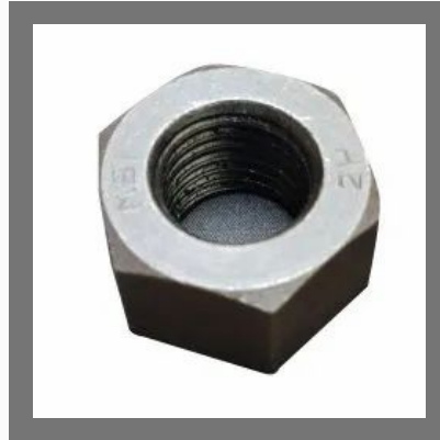
Astm A194 Gr 2h Heavy Hex Nuts