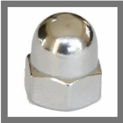
Hex Dome Nut