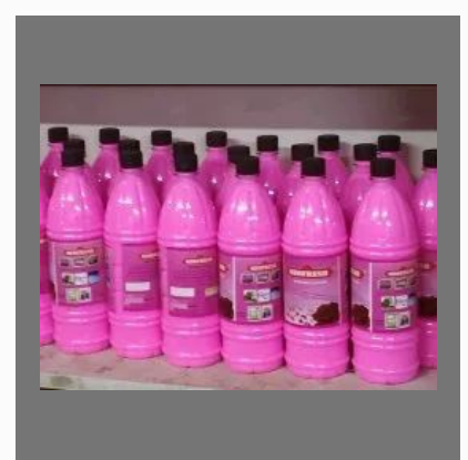
Floor Cleaning Chemicals