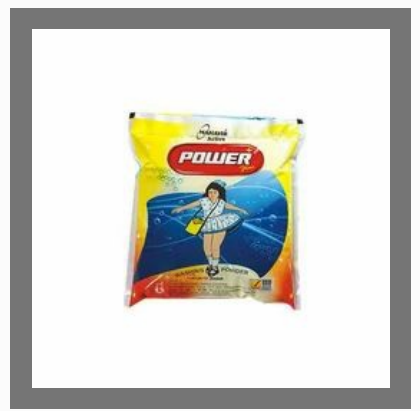
Active Detergent Powder