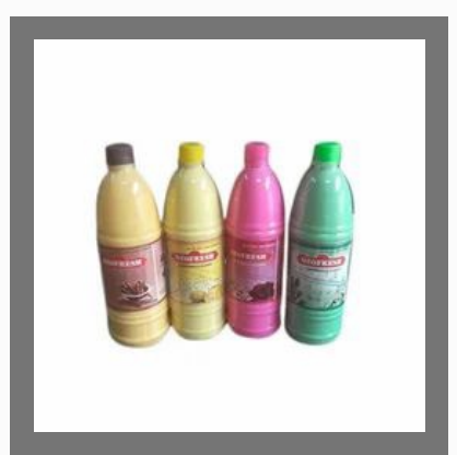
Antibacterial Liquid Floor Cleaner