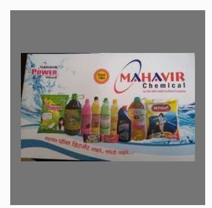
Quality Cleaning Materials