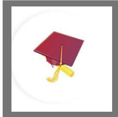
Children Future Education