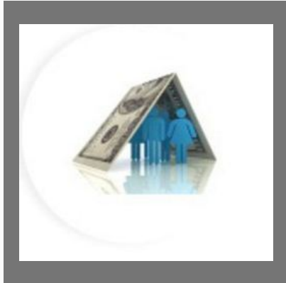
Future Financial Protection