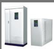
Power Management Devices