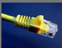
Networking Support Services