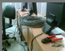
Networking Support Services