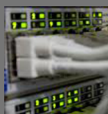
Networking Support Services