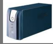
Power Management/Power Audit