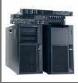
IBM Servers & POS Terminals/Lenovo Laptops & PCs