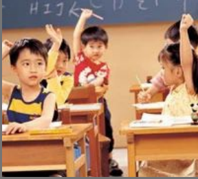
Child Care And Mental Health