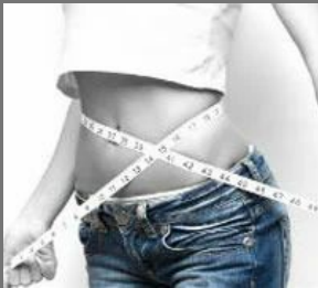
Weight Loss and Body Toning