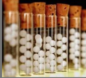
Homoeopathy - General Health