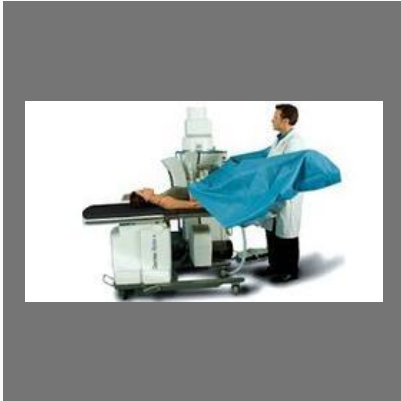
Lithotripsy (Dornier Compact Alpha Lithotripter)