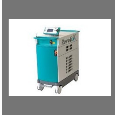
Lisa Holmium Yag Laser